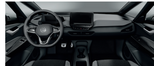
Interior Dusty Grey Dark/Piano Black