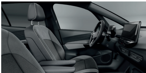
Design Seat "ArtVelours" Platinum Grey/Dusty Grey Dark Stands out with unique design