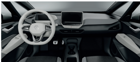
Interior Dusty Grey Dark/Electric White