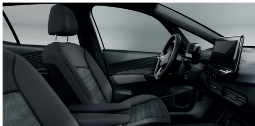
1st Seat Platinum Grey/Soul