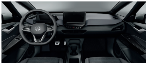
Interior Platinum Grey/Piano Black