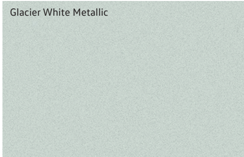
Glacier White Metallic