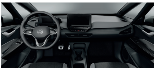
Interior Dusty Grey Dark/Piano Black