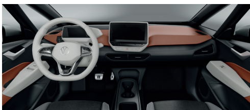
Interior Safrano Orange/Electric White 1