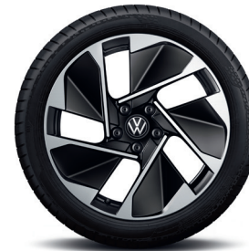
ID.3 1 ST with 18-inch alloy wheel Aerodynamic design