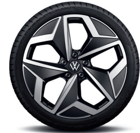
ID.3 1 ST Plus with 19-inch alloy wheel Aerodynamic design