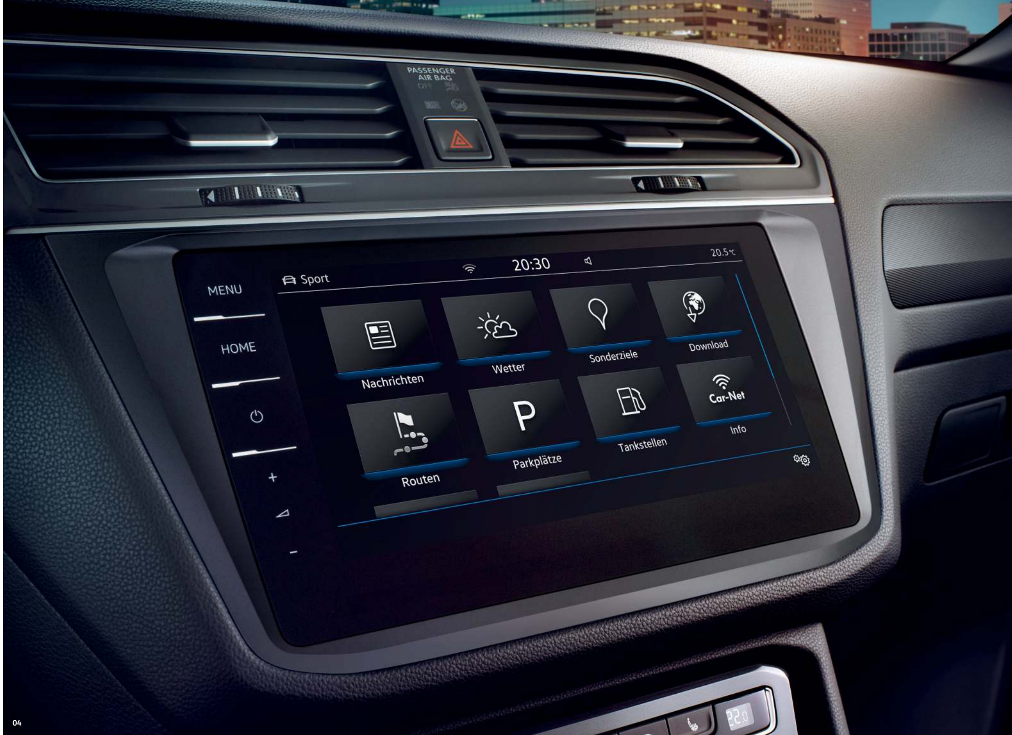
Interior shown is with 'Discover Pro' touch-screen navigation radio system. Optional on GTI/R models.