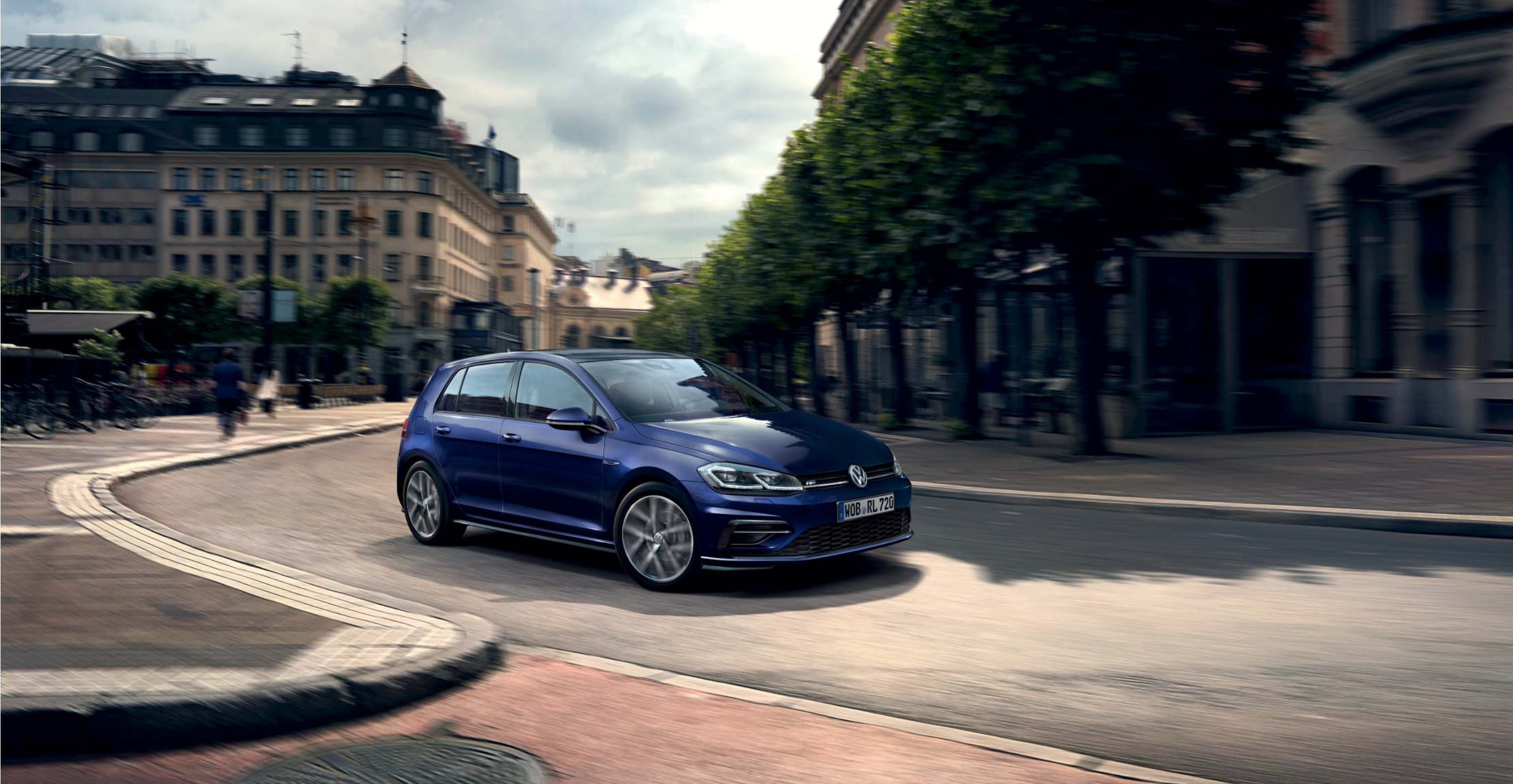
Model shown is Golf R-line with optional 18-inch 'Jurva' alloy wheels, LED headlights, panoramic sunroof and 'Atlantic Blue' metallic paint.