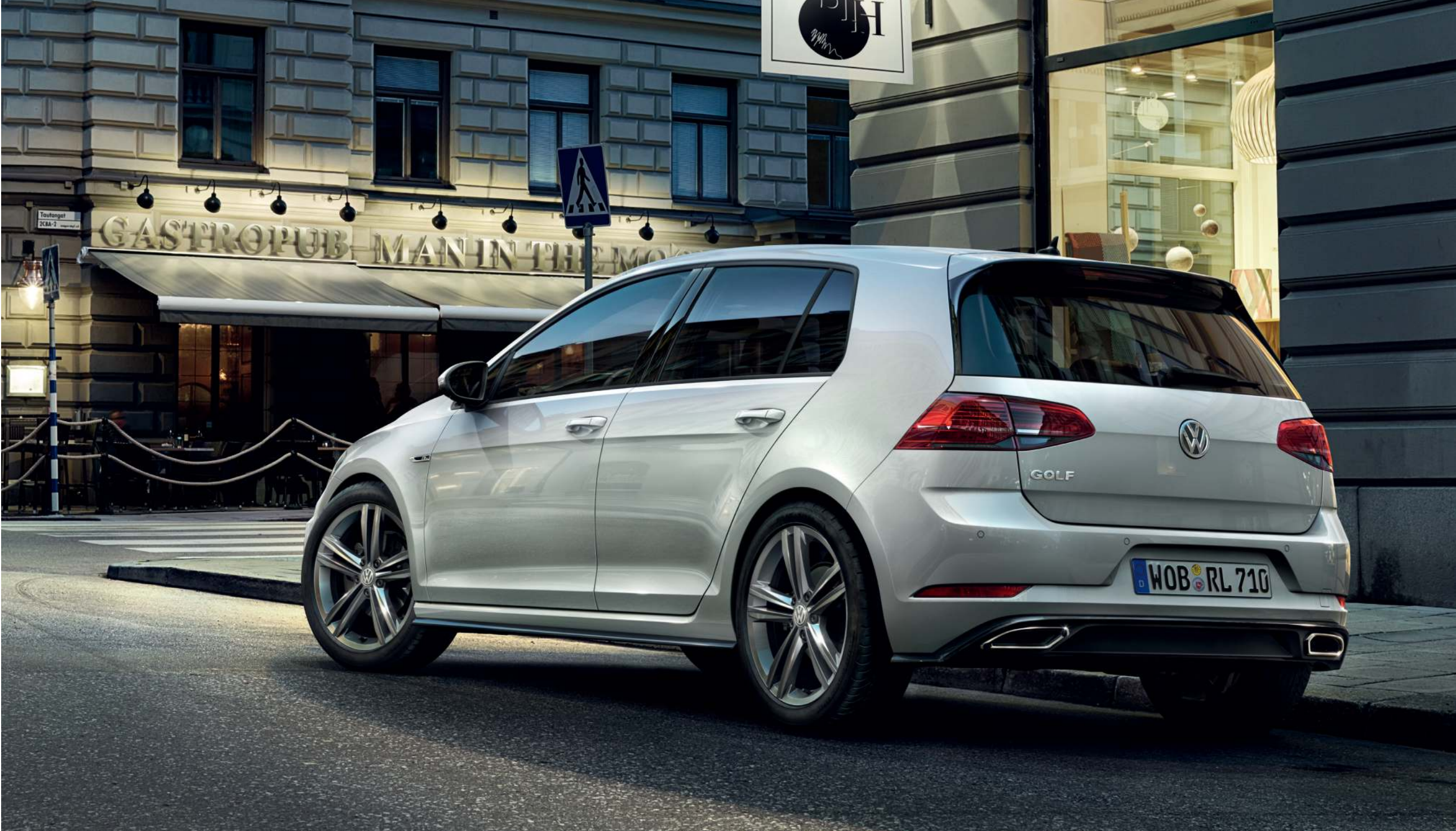
Model shown is Golf R-line with optional 18-inch 'Sebring' alloy wheels, LED headlights and 'Oryx White Pearl' effect paint.