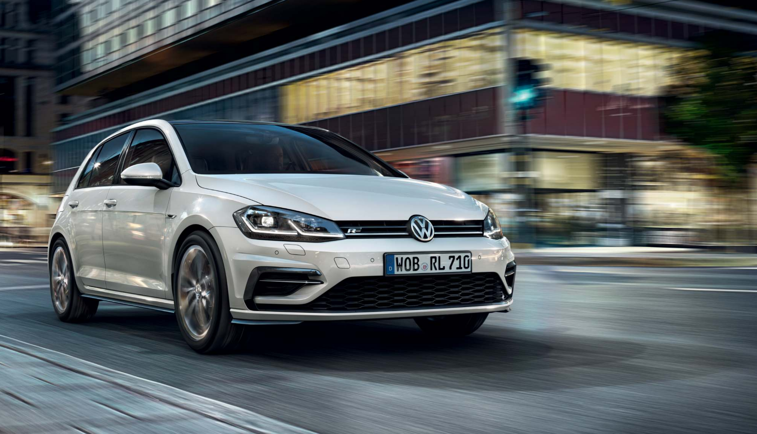
Model shown is Golf R-line with optional 18-inch 'Sebring' alloy wheels, LED headlights and 'Oryx White' Pearl effect paint.

01 The front of the Golf is characterised by the instantly recognisable Golf styling. Changing with the times while remaining true to its heritage, the latest generation Golf delivers on every level.