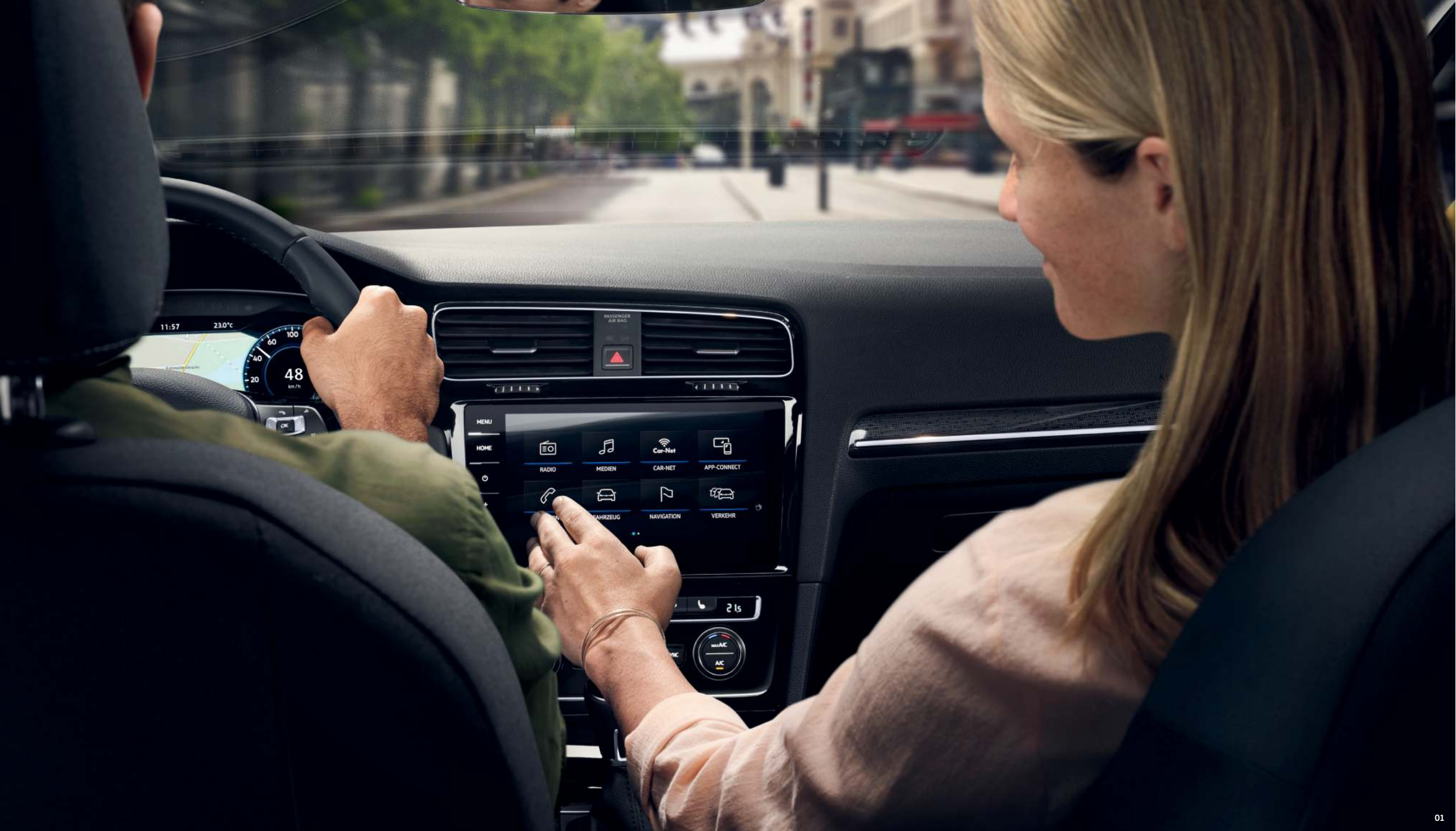
Interior shown is with 'Discover Pro' touch-screen navigation radio system, optional on GTI/R models.