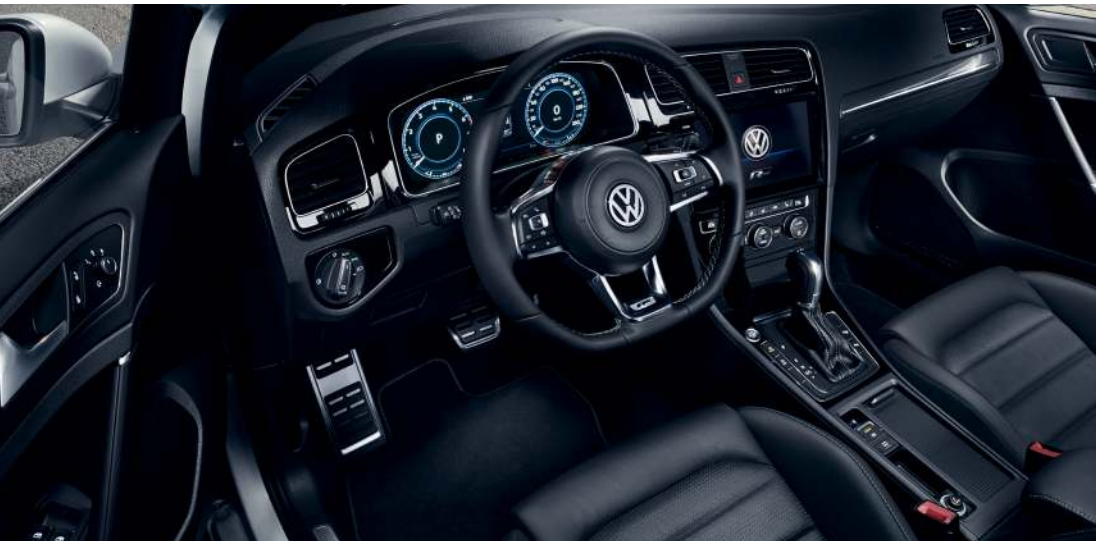
Model shown is Golf R-Line with optional R-Line interior styling pack

As soon as you climb in, you will notice the optional interior pack on the R-Line trim adds a sporty touch with numerous equipment details and high-quality materials, such as the sill panel trim, pedal cluster in brushed stainless steel and floor mats with decorative stitching. The optional R-Line sport seats in 'Vienna' leather and the striking R-Line logo on the front seat backrests enhance the sporty feel in the interior of your Golf.