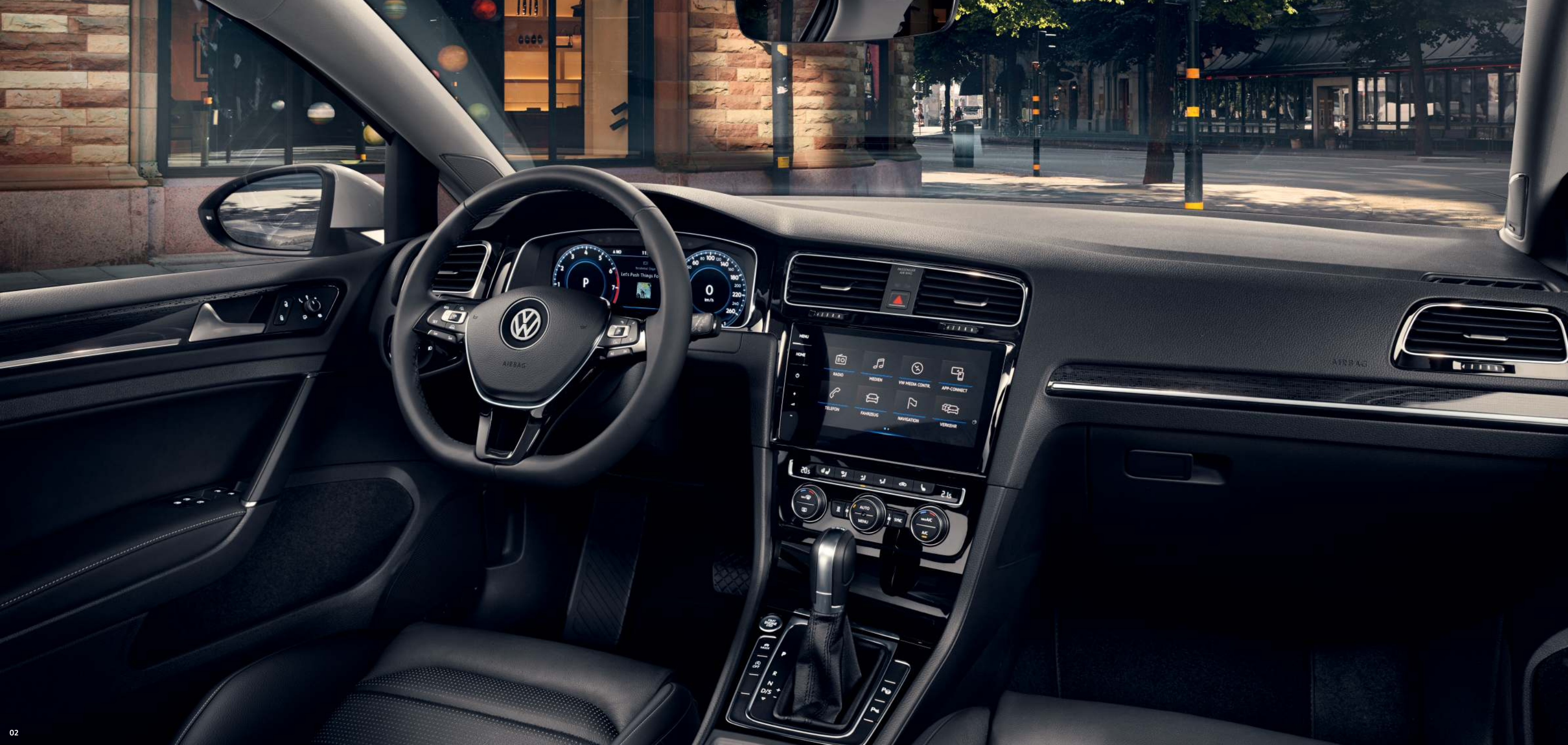
Interior shown is with 'Discover Pro' touch-screen navigation radio system, optional on GTI/R models.