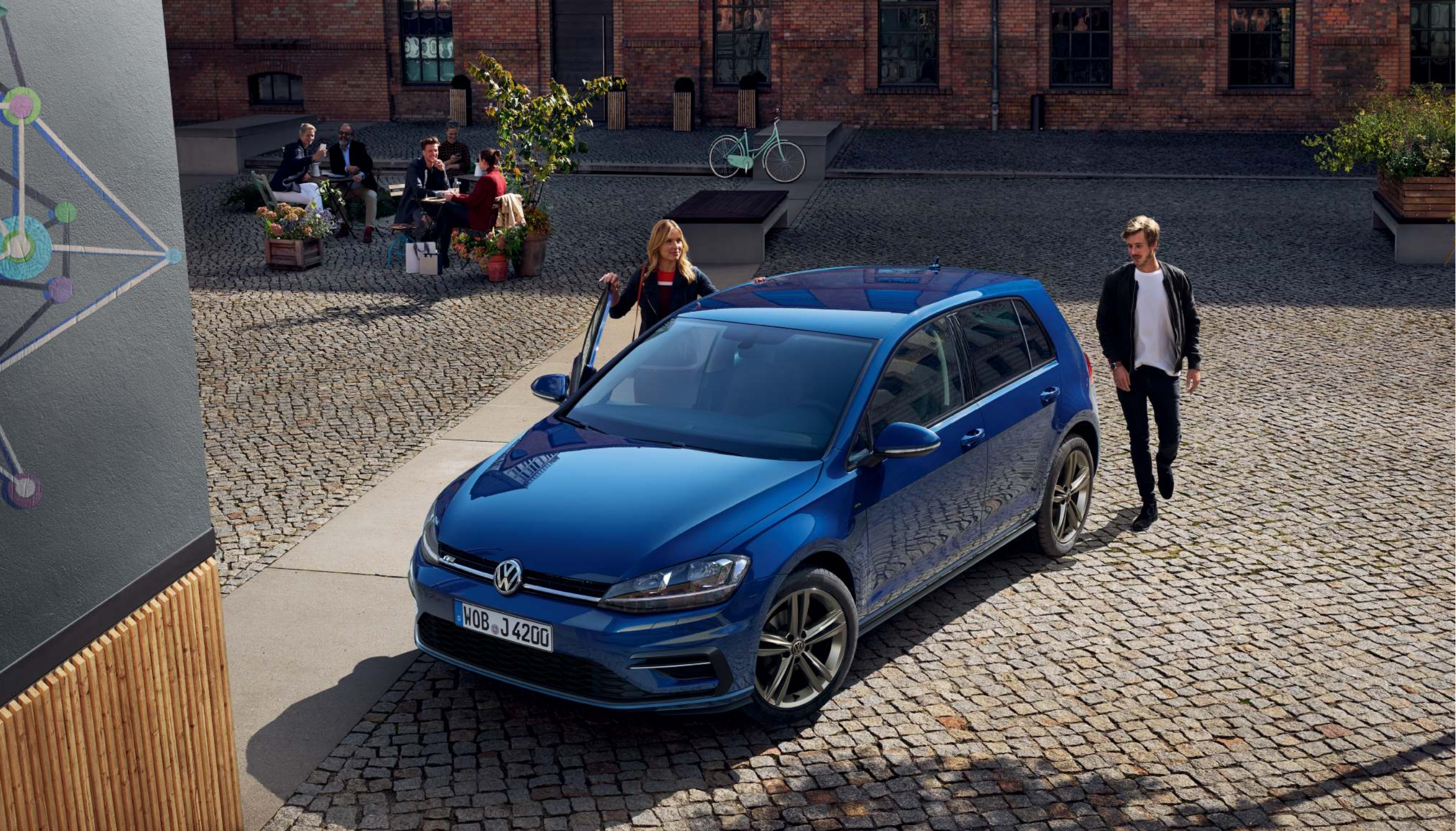
Model shown is Golf R-line with optional 18" 'Sebring' alloy wheels and 'Atlantic Blue' metallic paint.