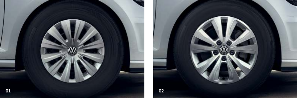
01 15-Inch 'Lyon' Alloy wheel. Standard on Trendline 02 16-Inch Alloy wheel 'Toronto'. Standard on Comfortline 03 17-Inch Alloy wheel 'Dijon'. Standard on Highline and R-line

Stylish alloy wheels contribute to the charismatic road presence of the Golf, with a choice of elegant, classic or sporty designs adding a touch of individuality.