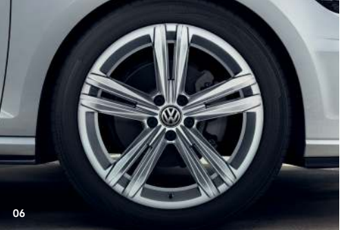
04 17-Inch Alloy Wheel 'Singapore'. Optional on Highline and R-line 05 17-Inch Alloy Wheel 'Sebring'. Optional on Highline and R-line 06 18-Inch Alloy wheel 'Sebring'. Optional on R-line 07 18-Inch Alloy wheel 'Jurva'. Optional on Highline and R-line