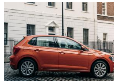
Note: images above depict Polo Comfortline with Technology Pack 16" 'Las Minas' alloy wheel

The above specifications are for information purposes only as our products are continually updated and changes may be made to the specifications at any time. If you require any specific feature, you must consult your local dealer who is regularly updated with any change in specification. Specifications are subject to change without notice.