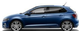
Reef Blue Metallic*