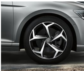
OPTIONAL ON R-LINE & GTE 18" 'Bonneville' alloy wheels in Burnished Black 8J x 18 Tyres: 235/45 R18