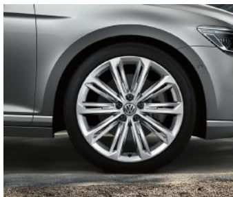
OPTIONAL ON R-LINE 19" 'Verona' alloy wheels 8J x 19 Tyres: 235/40 R19