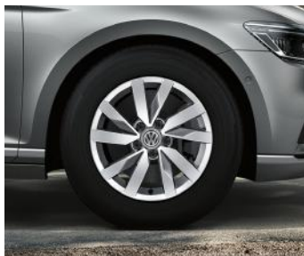
STANDARD ON PASSAT 16" 'Aragon' alloy wheels 6.5J x 16 Tyres: 215/60 R16