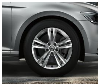
OPTIONAL ON BUSINESS & ELEGANCE 17" 'Sebring' alloy wheels