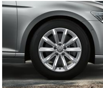
STANDARD ON BUSINESS 17" 'London' alloy wheels 7J x 17 Tyres: 215/55 R17