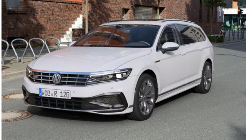
Note: The above image shows 'R-Line' Model in Oryx White with optional Matrix LED package.