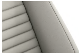
"Vienna" leather (WL1) Mistral (YR) Optional on Business models