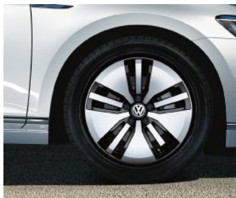
STANDARD ON GTE 17" 'Montpellier' alloy wheels 7J x 17 Tyres: 215/55 R17