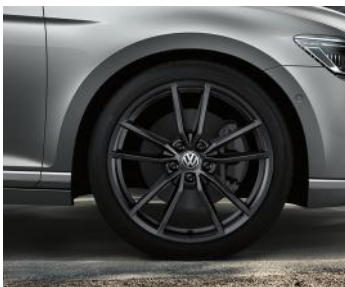
OPTIONAL ON R-LINE 19" 'Pretoria' alloy wheels in Matt Dark Graphite 8J x 19 Tyres: 235/40 R19