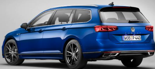
Note: The above image shows 'R-Line' Model in Lapiz Blue with 'Pretoria' 19" alloy wheels in Grey Metallic and optional Matrix LED package.