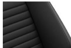
"Nappa" leather (WL7) Titan Black/Blue(TO) Optional on Elegance/ R-Line