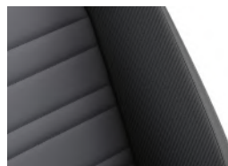
"Carbon-Flag"/Vienna (W05) Flint Grey/Titan Black (OK) Optional on R-Line

Note 1: some parts of leather interior trim will contain artificial leather. Note 2: the print processes do not allow exact reproduction of the upholstery & insert colours.