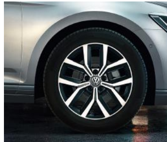
STANDARD ON ELEGANCE 17" 'Nivelles' alloy wheels 7J x 17 Tyres: 215/55 R17