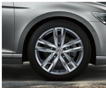
OPTIONAL ON ELEGANCE & R-LINE 18" 'Dartford' alloy wheels in Antracite Grey 8J x 18 Tyres: 235/45 R18