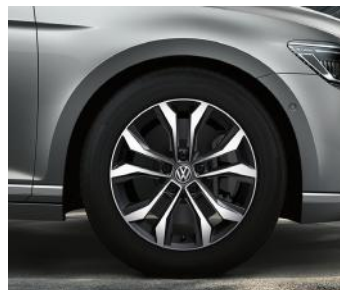
OPTIONAL ON BUSINESS & ELEGANCE 17" 'Soho' alloy wheels with diamond turned surface 7J x 17 Tyres: 215/55 R17