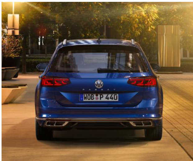
Note: The above image shows 'R-Line' Model in Lapiz Blue with optional Matrix LED package.