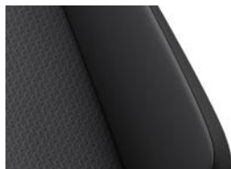
"Lizard" cloth Titan Black/Blue (TO) Standard on Passat models