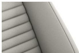
"Alcantara"/ "Vienna" leather Mistral (YR) Standard on Elegance/ R-Line