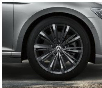
OPTIONAL ON R-LINE & GTE 18" 'Liverpool' alloy wheels in Admantium Dark 8J x 18 Tyres: 235/45 R18