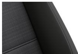
"Weave" cloth Titan Black/Blue (TO) Standard on Business models