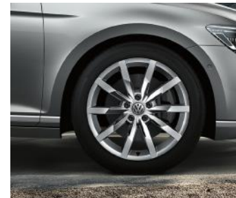
STANDARD ON R-LINE 18" 'Monterrey' alloy wheels in grey metallic 8J x 18 Tyres: 235/55 R18