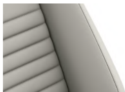
"Nappa" leather (WL7) Mistral (YR) Optional on Elegance and R-Line