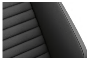
"Vienna" leather (WL1) Titan Black/Blue (TO) Optional on Business models