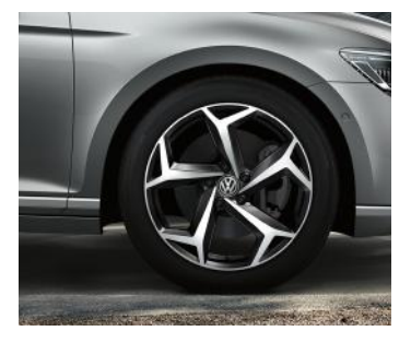
OPTIONAL ON R-LINE & GTE 18" 'Bonneville' alloy wheels in Burnished Black 8J x 18 Tyres: 235/45 R18