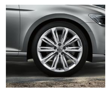
OPTIONAL ON R-LINE 19" 'Verona' alloy wheels 8J x 19 Tyres: 235/40 R19