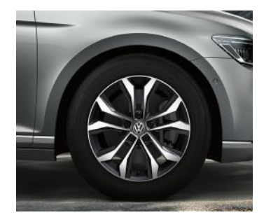
OPTIONAL ON BUSINESS & ELEGANCE 17" 'Soho' alloy wheels with diamond turned suface 7J x 17 Tyres: 215/55 R17