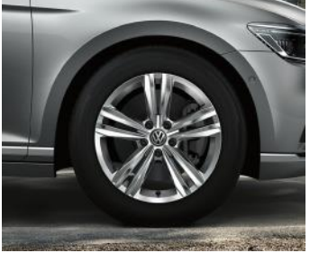
OPTIONAL ON BUSINESS & ELEGANCE 17" 'Sebring' alloy wheels

STANDARD ON GTE 17" 'Montpellier' alloy wheels 7J x 17 Tyres: 215/55 R17