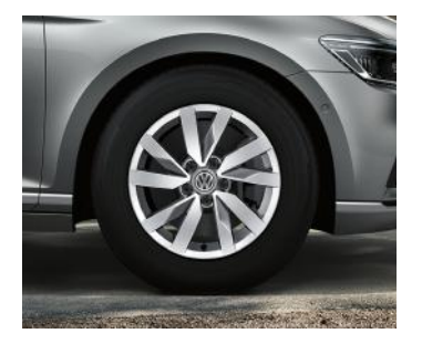
STANDARD ON PASSAT 16" 'Aragon' alloy wheels 6.5J x 16 Tyres: 215/60 R16