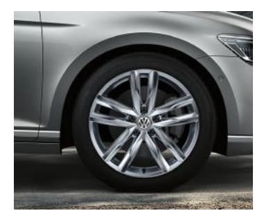
OPTIONAL ON ELEGANCE & R-LINE 18" 'Dartford' alloy wheels in Antracite Grey 8J x 18 Tyres: 235/45 R18