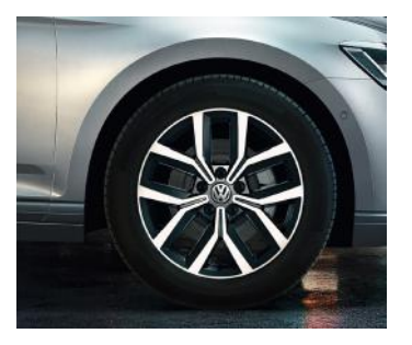
STANDARD ON ELEGANCE 17" 'Nivelles' alloy wheels 7J x 17 Tyres: 215/55 R17