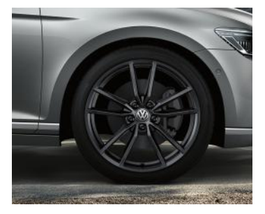
OPTIONAL ON R-LINE 19" 'Pretoria' alloy wheels in Matt Dark Graphite 8J x 19 Tyres: 235/40 R19