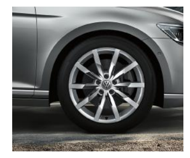
STANDARD ON R-LINE 18" 'Monterrey' alloy wheels in grey metallic 8J x 18 Tyres: 235/55 R18