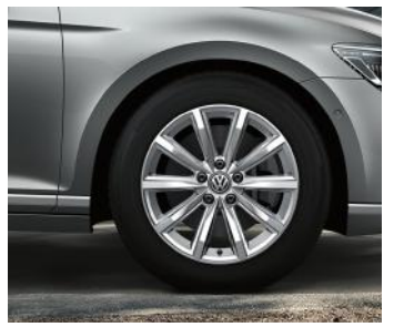
STANDARD ON BUSINESS 17" 'London' alloy wheels 7J x 17 Tyres: 215/55 R17