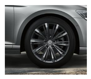
OPTIONAL ON R-LINE & GTE 18" 'Liverpool' alloy wheels in Admantium Dark 8J x 18 Tyres: 235/45 R18