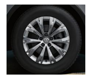
STANDARD ON TRENDLINE 17" Montana alloy wheels 7J x 17 alloy wheels. Tyres 215/65 R17 low rolling resistance tyres