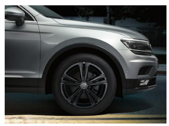
Note: The image above shows standard 'R-Line' Black Style 19" Sebring alloy wheels