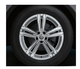
STANDARD ON R-LINE 19" Sebring alloy wheels 8.5J x 19 alloy wheels. Tyres 255/45 R19 low rolling resistance tyres

7.5Jx 18 alloy wheels. Tyres 235/55 R18 low rolling resistance tyres