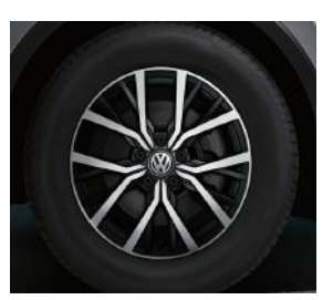
STANDARD ON COMFORTLINE 17" Tulsa alloy wheels 7J x 17 alloy wheels. Tyres 215/65 R17 low rolling resistance tyres