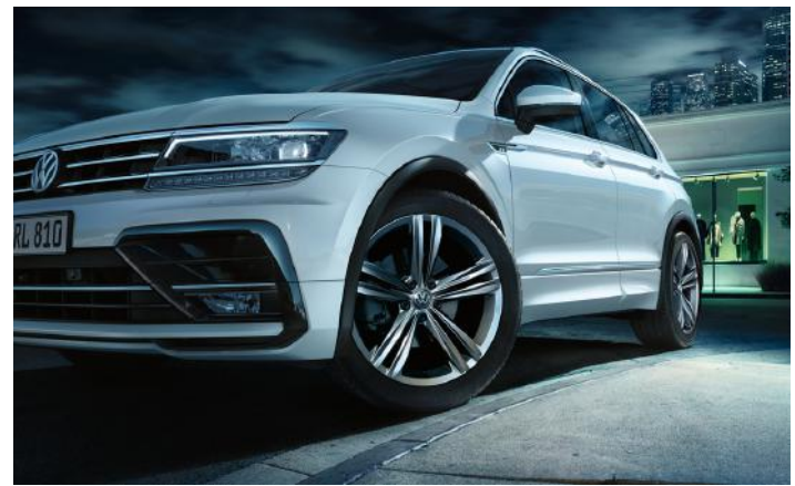
The above specifications are for information purposes only as our products are continually updated and changes may be made to the specifications at any time. If you require any specific feature, you must consult your local dealer who is regularly updated with any change in specification. Specifications are subject to change without notice.