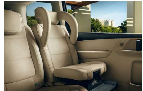
The above photo contains optional integrated child seat

The above specifications are for information purposes only as our products are continually updated and changes may be made to the specifications at any time. If you require any specific feature, you must consult your local dealer who is regularly updated with any change in specification. Specifications are subject to change without notice.