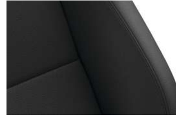
"Vienna" leather Titan Black (BY) Standard on Highline/ Optional on Comfortline

Please note, the print processes do not allow exact reproduction of the upholstery colours.