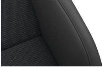
"Stripes" cloth Titan Black (BY) Standard on Comfortline