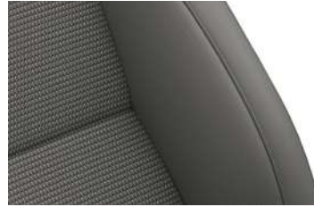
"Stripes" cloth Palladium Grey (BW) Standard on Comfortline