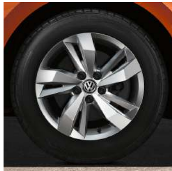
STANDARD ON COMFORTLINE OPTIONAL ON TRENDLINE

15" steel wheels 5.5J X 15 Tyres: 185/65 R15