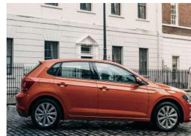
Note: images above depict Polo Comfortline with Technology Pack 16" 'Las Minas' alloy wheel

The above specifications are for information purposes only as our products are continually updated and changes may be made to the specifications at any time. If you require any specific feature, you must consult your local dealer who is regularly updated with any change in specification. Specifications are subject to change without notice.