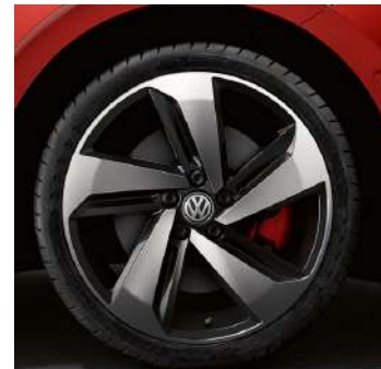
STANDARD ON GTI

16" Torsby alloy wheels in Black with diamond-turned surface. 6.5J X 16 Tyres: 195/55 R16