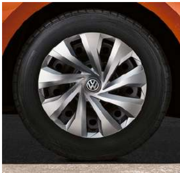
STANDARD ON TRENDLINE

15" steel wheels 5.5J X 15 Tyres: 185/65 R15