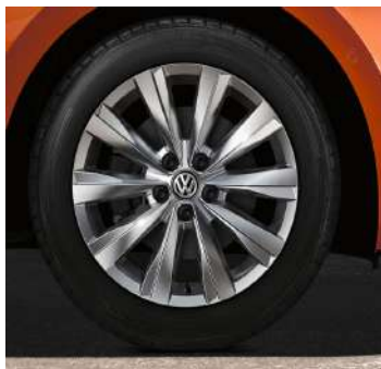
OPTIONAL ON COMFORTLINE

17" Milton Keynes alloy wheels with diamond-turned surface 7.5J X 17 Tyres: 215/45 R17