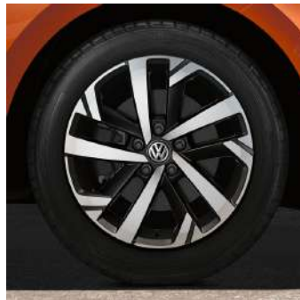
STANDARD ON R-LINE

15" Sassari alloy wheels 5.5J X 15 Tyres: 185/65 R15