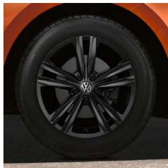
OPTIONAL ON R-LINE (BLACK PACK)

16" Las Minas alloy wheels 6.5J x 16 Tyres: 195/55 R16