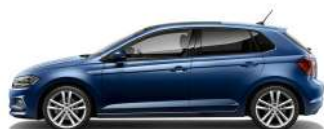
Reef Blue Metallic*