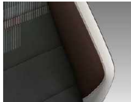
"Diag" (Design Pack Energetic Orange) Orange/Ceramique Cloth (GL) Optional on Style & R-Line