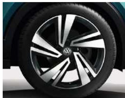
OPTIONAL ON STYLE & R-LINE 18" Nevada alloy wheels with burnished finish 7J X 18 Tyres:215/45 R18