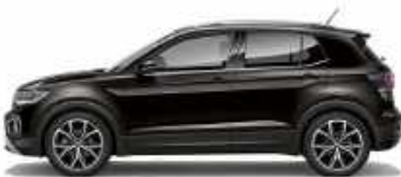
Black Solid * A1A1 Note: not available with R-Line