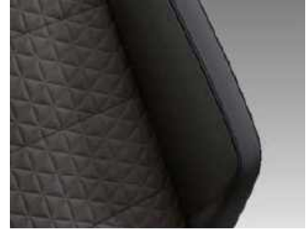
"Hexalink" Cloth Pearl Grey (FL) Standard on Style & R-Line