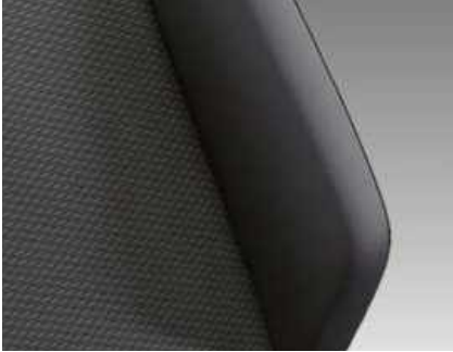
"Basket" Cloth Platinum Grey (EL) Standard on T-Cross