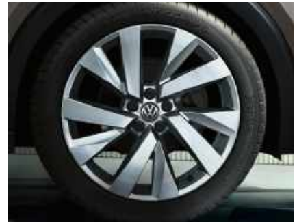
OPTIONAL ON STYLE & R-LINE 18" Funchal alloy wheels 7J X 18 Tyres:215/45 R18