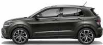
Urano Grey Solid 5K5K Note: not available with R-Line