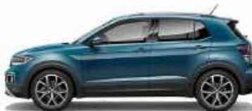
Dark Petrol Premium Solid* 5M5M Note: not available with R-Line