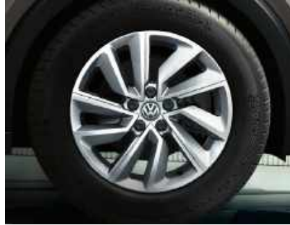
STANDARD ON LIFE 16" Belmont alloy wheels 6J X 16 Tyres:205/60 R16