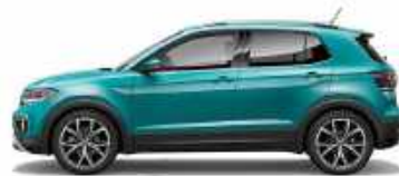
Makena Turquoise Premium Metallic * 0Z0Z