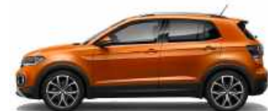
Energetic Orange Metallic * 4M4M