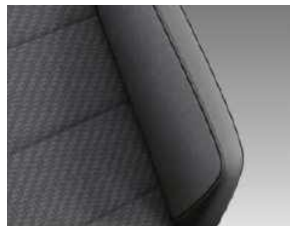
"Carbon Flag" Cloth (R-Line Interior) Crystal Grey (OK) Optional on R-Line