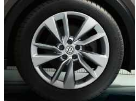
STANDARD ON STYLE 17" Bangalore alloy wheels 6J X 17 Tyres:205/55 R17