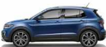
Reef Blue Metallic * 0A0A