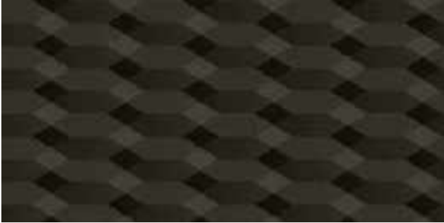
Softell Standard on T-Cross