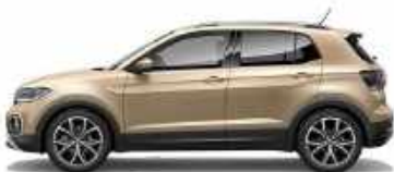
Pale Copper Metallic * J7J7