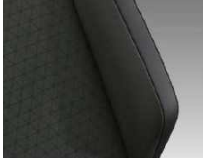
"Triangle Ties" Cloth Platinum Grey (UL) Standard on Life