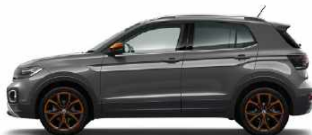
Design Pack: Energetic Orange