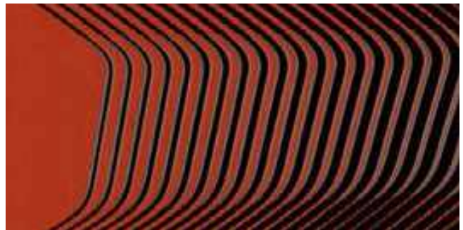
Transition - Energetic Orange & Grey Optional on Style & R-Line (Design Pack Energetic Orange)