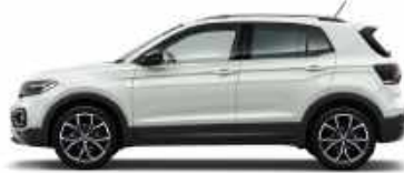
Pure White Solid * 0Q0Q