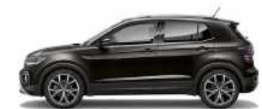
Deep Black Pearl Effect * 2T2T

*Optional at extra cost • Please see Options section for pricing information.