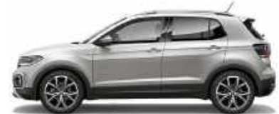
Reflex Silver Metallic * 8E8E