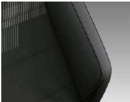
"Diag" (Design Pack Black) Neutral/Titan Black Cloth (UL) Optional on Style & R-Line