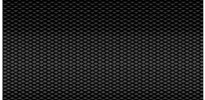
Pinapple Standard on Life