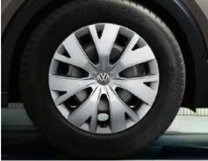
STANDARD ON T-CROSS 16" Dublin steel wheels 6J X 16 Tyres: 205/60 R16