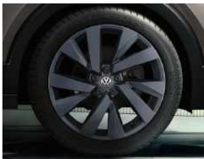
OPTIONAL ON STYLE & R-LINE 18" Funchal alloy wheels - Adamantium Silver 7J X 18 Tyres:215/45 R18