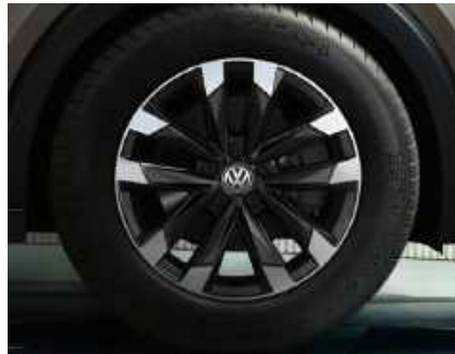
OPTIONAL ON T-CROSS & LIFE 16" Rochester alloy wheels 6J X 16 Tyres:205/60 R16