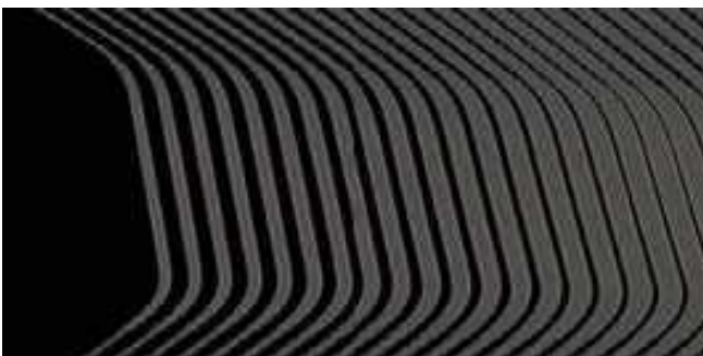
Transition - High-gloss Black & Grey Optional on Style & R-Line (Design Pack Black & Design Pack Bamboo Garden)