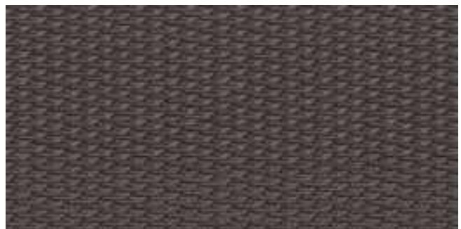
Race Optional on R-Line (R-Line Interior)