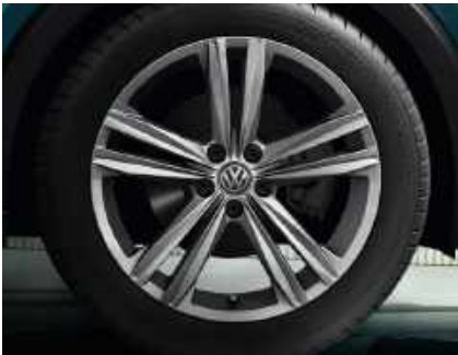
STANDARD ON R-LINE 17" Sebring alloy wheels 6.5J X 17 Tyres:205/55 R17