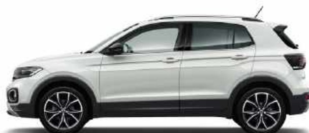
Design Pack: Black