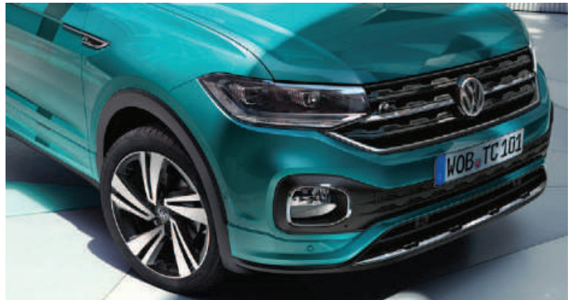
Images show optional interior equipment and 18" Nevada alloy wheel.