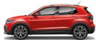
Flash Red Solid * D8D8 Note: not available with R-Line