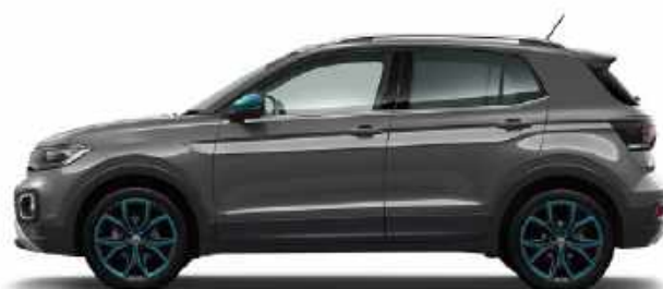
Design Pack: Bamboo Garden