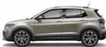
Limestone Grey Metallic * Z1Z1