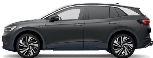
Manganese Grey Metallic* 5VA1