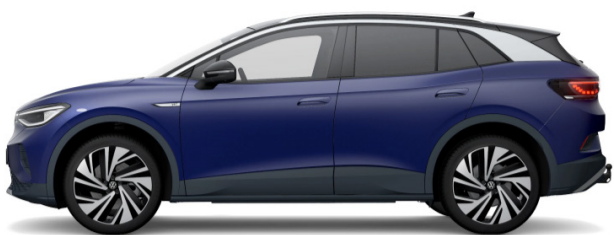
Blue Dusk Metallic* 2PA1