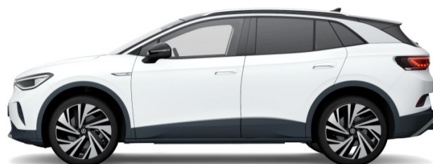
Glacier White Metallic* 2YA1