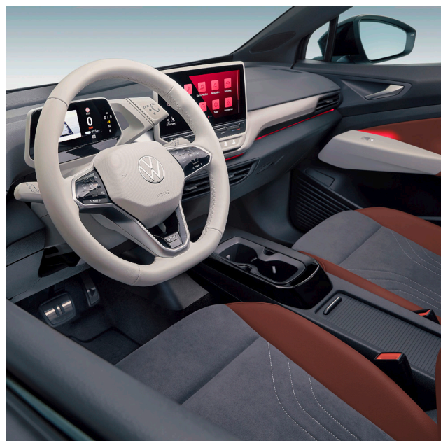
Standard on ID.4 1st Platinum Grey/Florence Brown White/Platinum Grey

Note 1: Some parts of leather interior trim will contain artificial leather. Note 2: The print processes do not allow exact reproduction of the upholstery & insert colours.