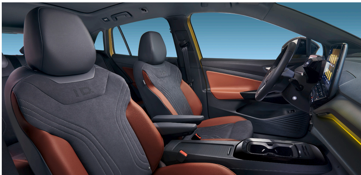
'ArtVelours' Microfleece Platinum Grey/Florence Brown Standard on ID.4 1st and 1st Max