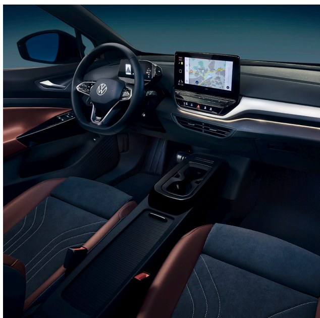
Standard on ID.4 1st & 1st Max Platinum Grey/Florence Brown Soul/Black/Platinum Grey