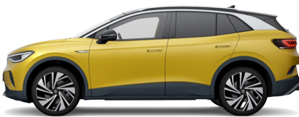
Honey Yellow Metallic* G8A1