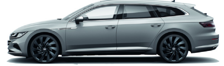
Pyrite Silver Metallic*