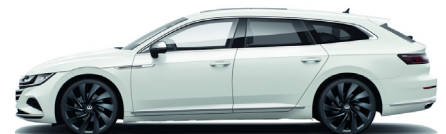
Oryx White Pearl Effect** 1