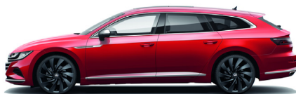
Kings Red Metallic*