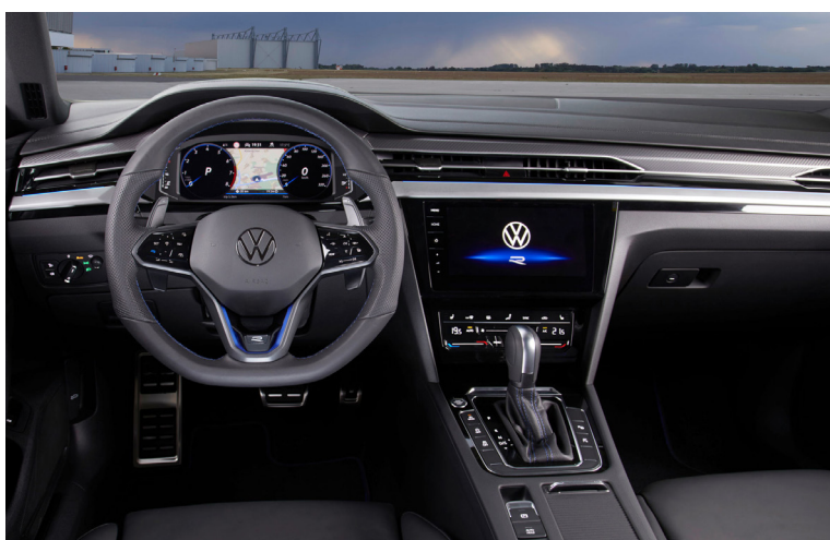
The above image shows optional Navigation System Discover Pro 9.2" display