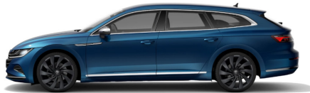
Kingfisher Blue Metallic* 1