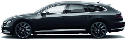
Urano Grey Solid