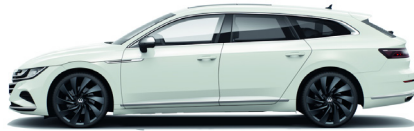
Pure White Solid