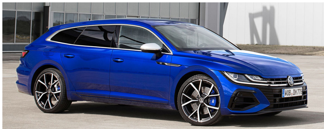
The above image shows optional Lapiz Blue metallic paint with optional 20" Estoril alloy wheels

The above specifications are for information purposes only as our products are continually updated and changes may be made to the specifications at any time. If you require any specific feature, you must consult your local dealer who is regularly updated with any change in specification. Specifications are subject to change without notice.