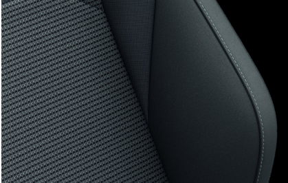
"Sideways" cloth Titan Black (TO) Standard on Arteon models