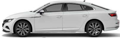
Pure White Solid