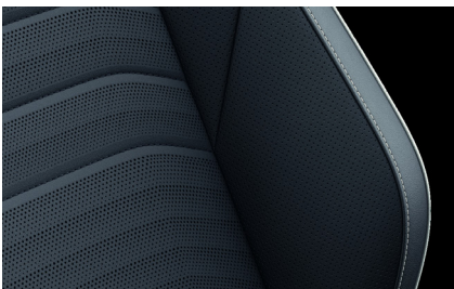
"Nappa" leather* (WL6) Titan Black (TO) Optional on Elegance models

* Optional at extra cost. • Please note, the print processes do not allow exact reproduction of the upholstery colours.