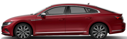
Kings Red Metallic