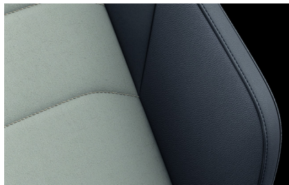
"ArtVelours Microfleece/Vienna" cloth & leather Mistral/Raven (YS) Optional on Elegance models