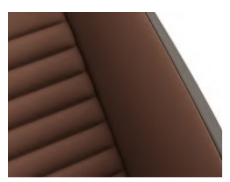
"Nappa" leather (WL7) Florence/Titan Black (DN) Optional on Elegance/ R-Line Note: Requires PDS Black Headliner

"Nappa" leather (WL7) Titan Black/Blue(TO) Optional on Elegance/ R-Line