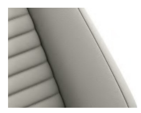
"Vienna" leather (WL1) Mistral (YR) Optional on Business models