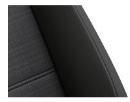
"Weave" cloth Titan Black/Blue (TO) Standard on Business models