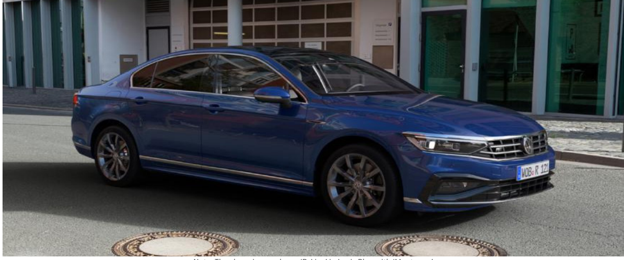
Note: The above image shows 'R-Line' in Lapiz Blue with 'Monterrey' 18" alloy wheels in Grey Metallic and optional Matrix LED package.