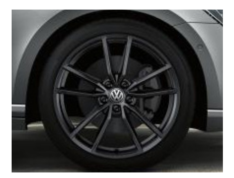
OPTIONAL ON R-LINE 19" 'Pretoria' alloy wheels in Matte Dark Graphite 8J x 19 Tyres: 235/40 R19