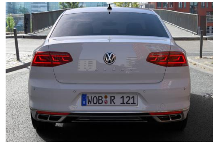
Note: The above image shows 'R-Line' Model with optional Matrix LED package.