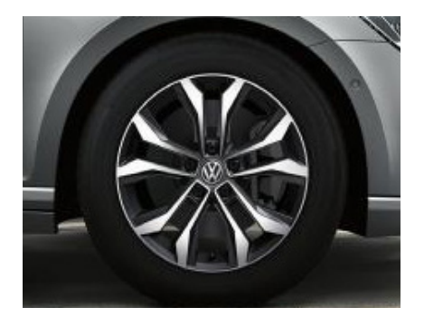
OPTIONAL ON BUSINESS & ELEGANCE 17" 'Soho' alloy wheels with diamond turned suface 7J x 17 Tyres: 215/55 R17