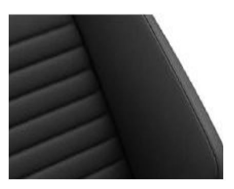
"Nappa" leather (WL8) Titan Black/Blue(TO) Standard on GTE

Note 1: Some parts of leather interior trim will contain artificial leather. Note 2: The print processes do not allow exact reproduction of the upholstery & insert colours.