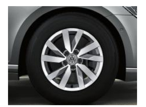
STANDARD ON PASSAT 16" 'Aragon' alloy wheels 6.5J x 16 Tyres: 215/60 R16