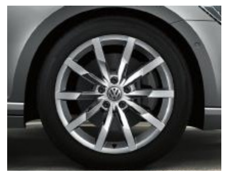
STANDARD ON R-LINE 18" 'Monterrey' alloy wheels in grey metallic 8J x 18 Tyres: 235/45 R18