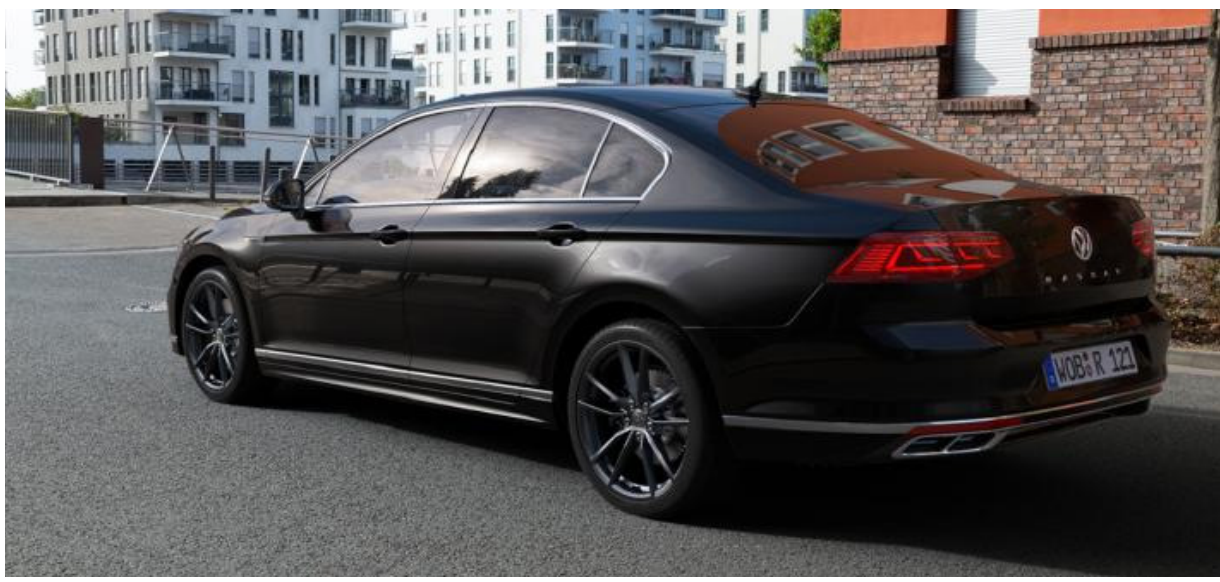
Note: The above image shows 'R-Line' Model with optional 'Pretoria' 19" alloy wheels in optional Matte Dark Graphite paint and optional Matrix LED package.

The above specifications are for information purposes only as our products are continually updated and changes may be made to the specifications at any time. If you require any specific feature, you must consult your local dealer who is regularly updated with any change in specifications. Specifications are subject to change without notice. Effective from 01 January 2021, for production from CW48/2020 onwards. All prices include VAT and VRT. These prices are subject to change once technical data comes available.