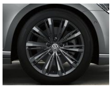
OPTIONAL ON R-LINE & GTE 18" 'Liverpool' alloy wheels in Admantium Dark 8J x 18 Tyres: 235/45 R18