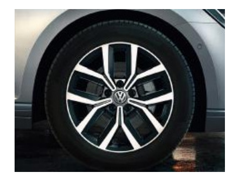
STANDARD ON ELEGANCE 17" 'Nivelles' alloy wheels 7J x 17 Tyres: 215/55 R17