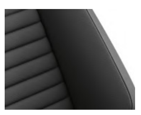
"Vienna" leather (WL1) Titan Black/Blue (TO) Optional on Business models

Note 1: Some parts of leather interior trim will contain artificial leather. Note 2: The print processes do not allow exact reproduction of the upholstery & insert colours.