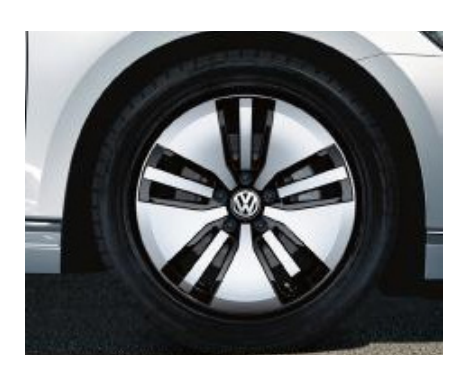
STANDARD ON GTE 17" 'Montpellier' alloy wheels 7J x 17 Tyres: 215/55 R17