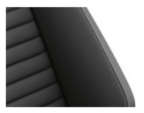
"ArtVelours"/ "Vienna" leather Titan Black/Blue (TO) Standard on Elegance/ R-Line