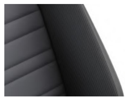
"Carbon-Flag"/Vienna (W05) Flint Grey/Titan Black (OK) Optional on R-Line