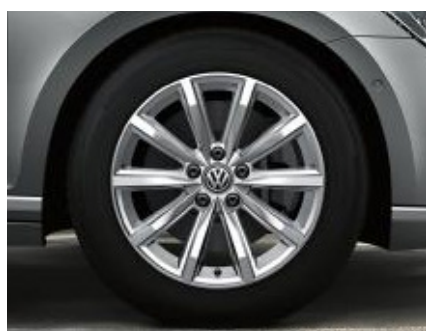
STANDARD ON BUSINESS 17" 'London' alloy wheels 7J x 17 Tyres: 215/55 R17