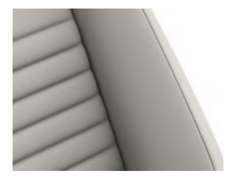
"Nappa" leather (WL7) Mistral (YR) Optional on Elegance and R-Line