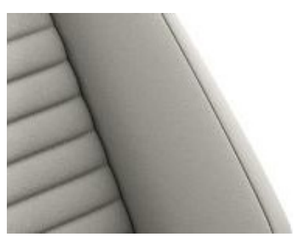
"Alcantara"/ "Vienna" leather Mistral (YR) Standard on Elegance/ R-Line