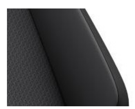
"Lizard" cloth Titan Black/Blue (TO) Standard on Passat models