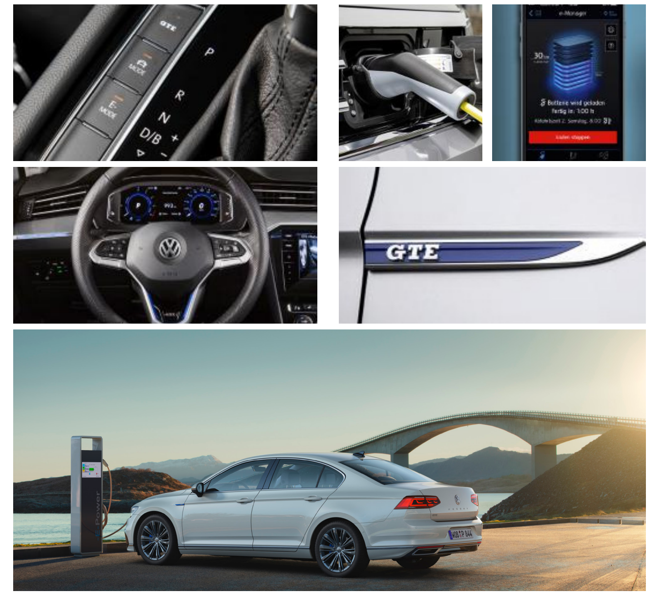
Note: The above image shows Passat GTE with optional "Liverpool" 18" aloy wheels in adamantium dark

The above specifications are for information purposes only as our products are continually updated and changes may be made to the specifications at any time. If you require any specific feature, you must consult your local dealer who is regularly updated with any change in specification. Specifications are subject to change without notice. Effective from 01 January 2021, for production from CW48/2020 onwards. All prices include VAT and VRT. These prices are subject to change once technical data comes available.