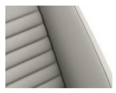
"Nappa" leather (WL8) Mistral (YR) Standard on GTE