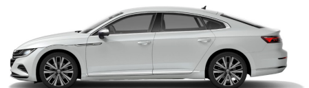
Oryx White Pearl Effect** 1