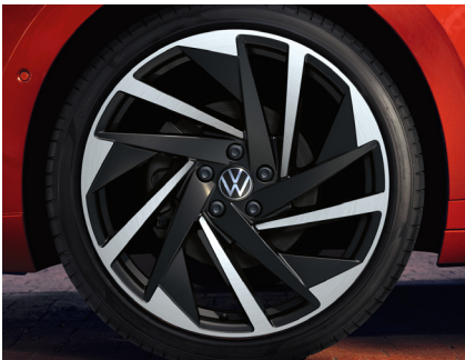
OPTIONAL ON ELEGANCE & R-LINE 20" 'Nashville' alloy wheels 8J x 20 Tyres: 245/35 R20