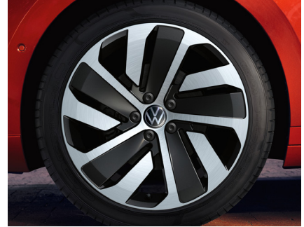
STANDARD ON R-LINE 19" 'Montevideo' alloy wheels 8J x 19 Tyres: 245/40 R19