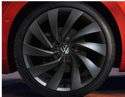
OPTIONAL ON R-LINE & R-MODEL 20" 'Rosario' black alloy wheels 8J x 20 Tyres: 245/35 R20