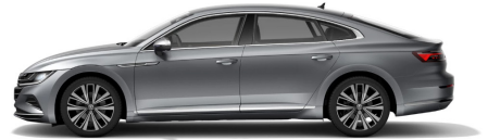
Pyrite Silver Metallic*