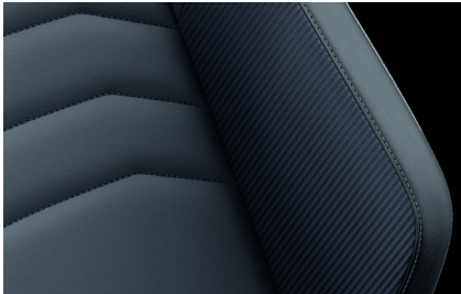
"R-Model Nappa/Carbon" leather* Titan Black (OH) Standard on R Model