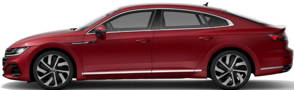
The above image shows optional Kings Red metallic paint

The above specifications are for information purposes only as our products are continually updated and changes may be made to the specifications at any time. If you require any specific feature, you must consult your local dealer who is regularly updated with any change in specification. Specifications are subject to change without notice.