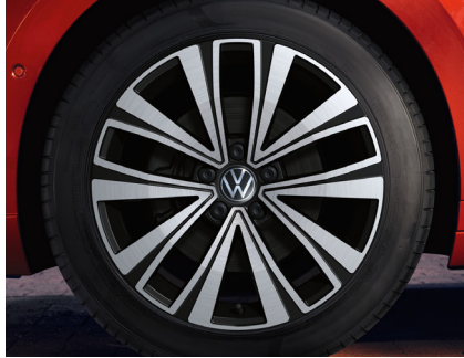
STANDARD ON ELEGANCE 18" 'Muscat' alloy wheels in 8J x 18 Tyres: 245/40 R18