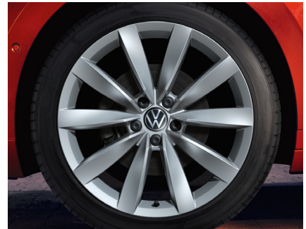
OPTIONAL ON ELEGANCE 19" 'Chennai' alloy wheels in Adamantium Silver 8J x 19 Tyres: 245/40 R19