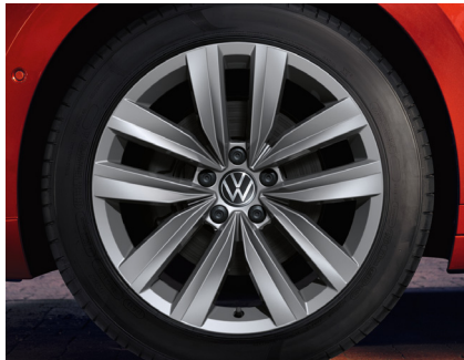
OPTIONAL ON ELEGANCE 18" 'Almere' Adamantium Silver alloy wheels 8J x 18 Tyres: 245/45 R18