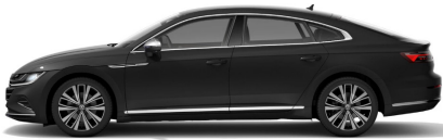
Urano Grey Solid