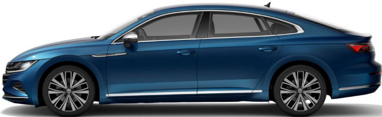
The above image shows optional Kingsfisher Blue metallic paint