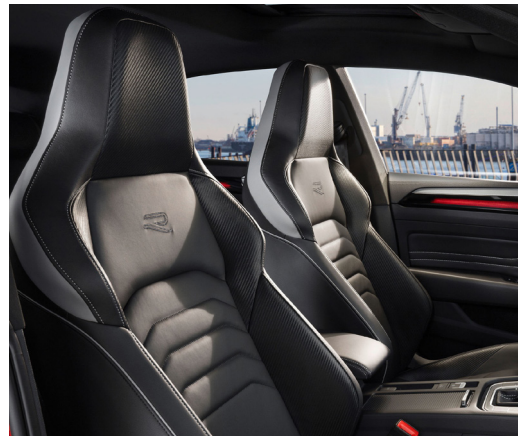
The above images show optional "Nappa" leather pack R-Line, with optional ErgoComfort seats