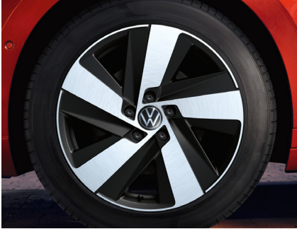
STANDARD ON ARTEON 18" 'Valdemossa' alloy wheels 8J x 18 Tyres: 245/45 R18