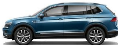
Blue Silk Metallic* 2B2B Note: Not available in combination with black style packs WSR/WST