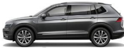
Platinum Grey Metallic*