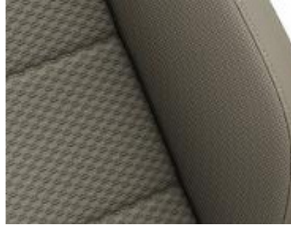
"Lassano" cloth Storm Grey (FY) Standard – Comfortline