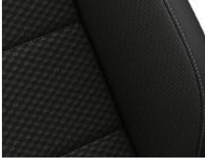
"Lassano" cloth Titan Black (BG) Standard – Comfortline