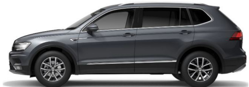
The above image shows optional Platinum Grey Metallic paint

The above specifications are for information purposes only as our products are continually updated and changes may be made to the specifications at any time. If you require any specific feature, you must consult your local dealer who is regularly updated with any change in specification. Specifications are subject to change without notice.