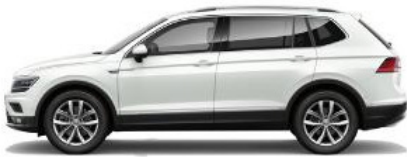
Pure White Solid