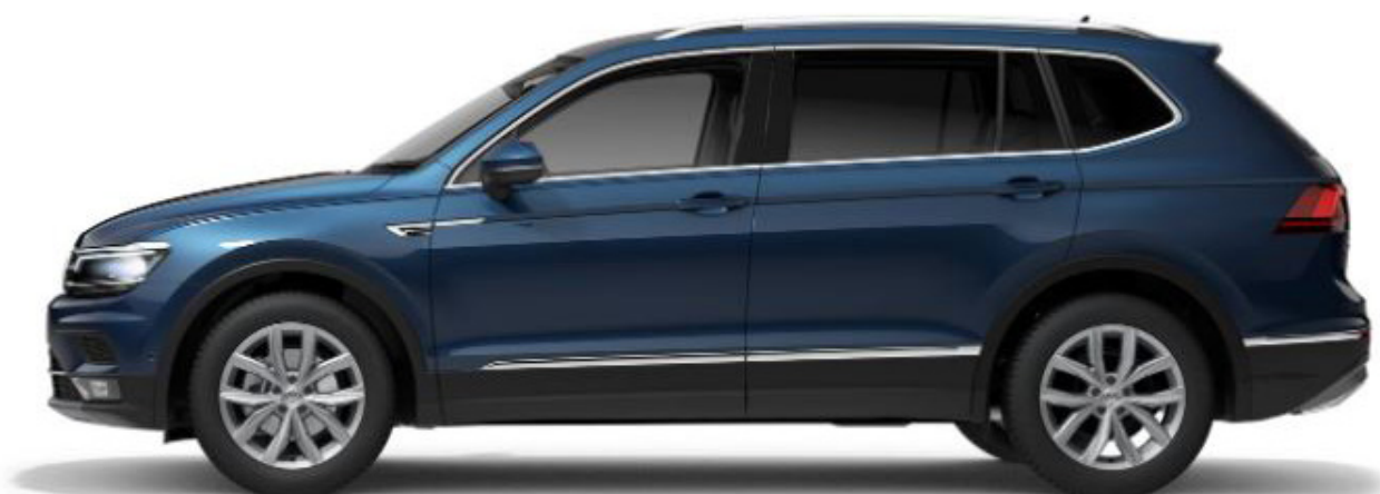
The above image shows optional Blue Silk Metallic paint

The above specifications are for information purposes only as our products are continually updated and changes may be made to the specifications at any time. If you require any specific feature, you must consult your local dealer who is regularly updated with any change in specification. Specifications are subject to change without notice.