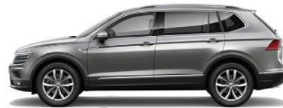
Pyrite Silver Metallic* K2K2

Note: Optional at extra cost see page 10 · † Premium paint see page 10