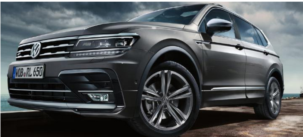
The above image shows optional Pyrite Silver Metallic paint

The above specifications are for information purposes only as our products are continually updated and changes may be made to the specifications at any time. If you require any specific feature, you must consult your local dealer who is regularly updated with any change in specification. Specifications are subject to change without notice.