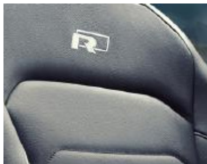
"Vienna" leather with R-Line logo (PL7) Titan Black/Crystal Grey (IH) Optional – R-Line

Please note, the print processes do not allow exact reproduction of the upholstery colours.