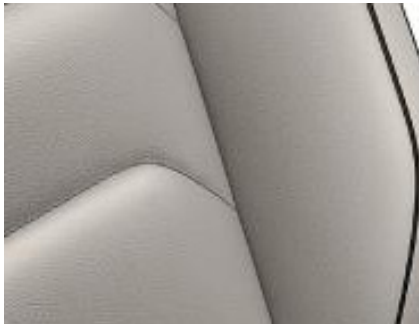
"Vienna" leather (WLR) Storm Grey/Titan Black (FY) Optional – Comfortline Standard-Highline & R-Line