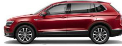
Ruby Red Metallic* 7H7H Note: Not available in combination with black style packs WSR/WST