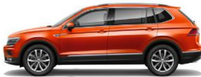
Habanero Orange Metallic*† V9V9 Note: Not available in combination with black style packs WSR/WST