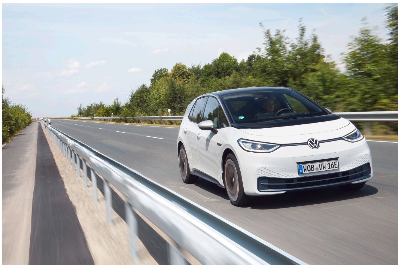
Note: The above image shows optional Silver Bi-Colour Styling Package

Note: ID.3 Tour 5 is a fully fledged 5-seat passenger vehicle