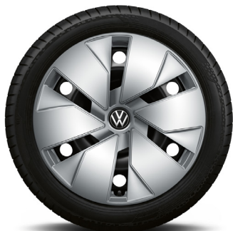
STANDARD ON ID.3 Life & Business 18" Steel wheels 7.5J x 18 Tyres: 215/55 R18