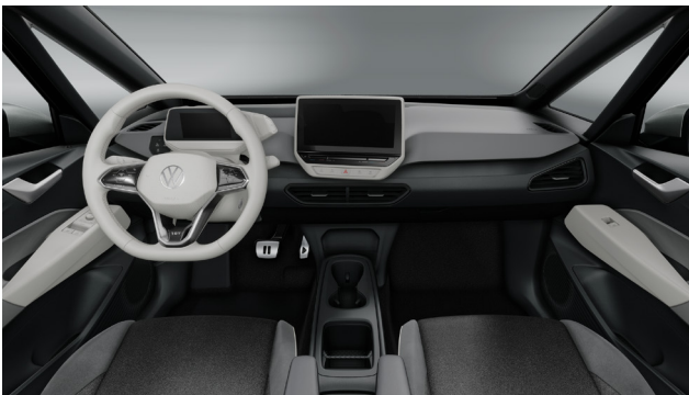
Standard from ID.3 Business