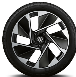
STANDARD ON ID.3 Family, Style, Tech & Max 18" 'East Derry' alloy wheels 7.5J x 18 Tyres: 215/55 R18