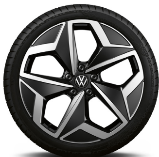
STANDARD ON ID.3 Tour, Tour 5 & 1st Plus OPTIONAL ON ID.3 Family, Style, Tech & Max 19" 'Andoya' alloy wheels 7.5J x 19 Tyres: 215/50 R19