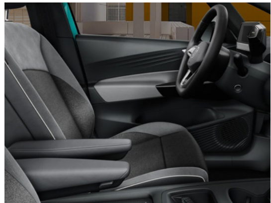
"Flow" 'ArtVelours' Microfleece Platinum Grey/Dusty Grey Dark Standard from ID.3 Business