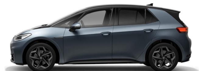
Stonewashed Blue Metallic* 1 5YA1 RRP €675

*Optional at extra cost · 1 Unavailable on 1st Plus models Please note, the print processes do not allow exact reproduction of the paint colours.