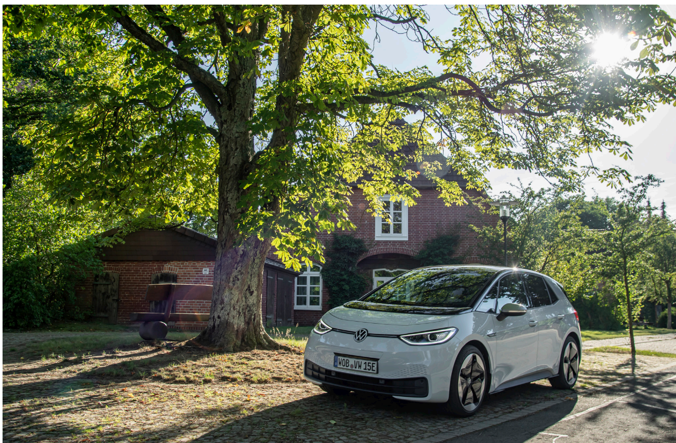
Note: The above image shows ID.3 Tour with optional 20" 'Sanya' alloy wheels and Silver Bi-Colour styling package

*Prices are representative of RRP's after government incentives for private buyers