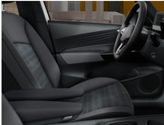
"Fragment" Cloth Platinum Grey/Soul Standard on ID.3 Life