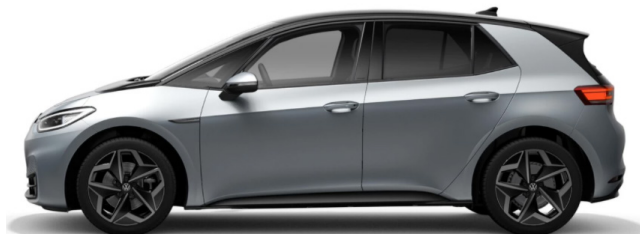
Scale Silver Metallic* 1 1TA1 RRP €675