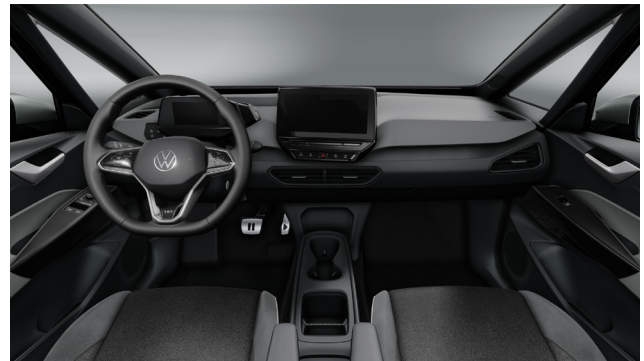
Standard from ID.3 Business