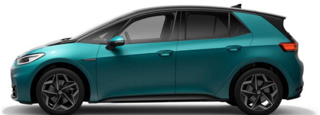
Makena Turquoise Metallic* 0ZA1 RRP €841