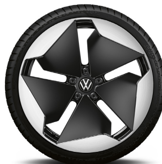
OPTIONAL ON ID.3 Family, Style, Tech, Max, Tour 20" 'Sanya' alloy wheels 7.5J x 20 Tyres: 215/45 R20