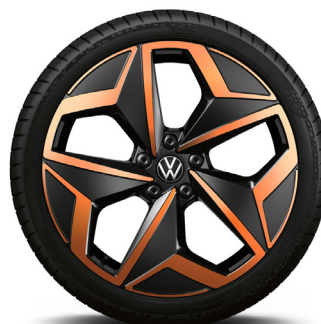
OPTIONAL ON ID.3 Family, Style, Tech, Max, Tour & Tour 5 19" 'Andoya' alloy wheels in 'Penney Copper' 7.5J x 19 Tyres: 215/50 R19