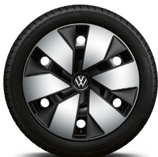
OPTIONAL ON ID.3 Life & Business 18" Steel wheels with Bi-Colour package 7.5J x 18 Tyres: 215/55 R18