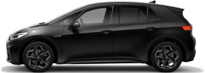
Manganese Grey Metallic* 5VA1 RRP €675