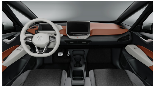
Standard from ID.3 Business