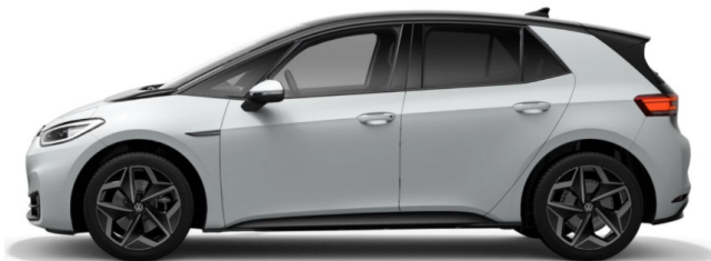
Glacier White Metallic* 2YA1 RRP €675