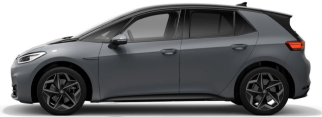
Moonstone Grey Solid C2A1 RRP €0