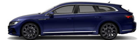
Lapiz Blue Metallic* 1