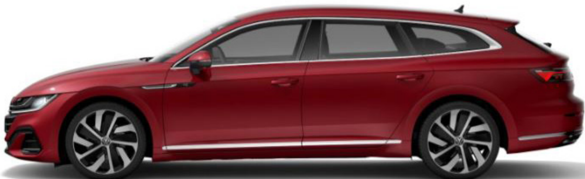
The above image shows optional Kings Red metallic paint

The above specifications are for information purposes only as our products are continually updated and changes may be made to the specifications at any time. If you require any specific feature, you must consult your local dealer who is regularly updated with any change in specification. Specifications are subject to change without notice.