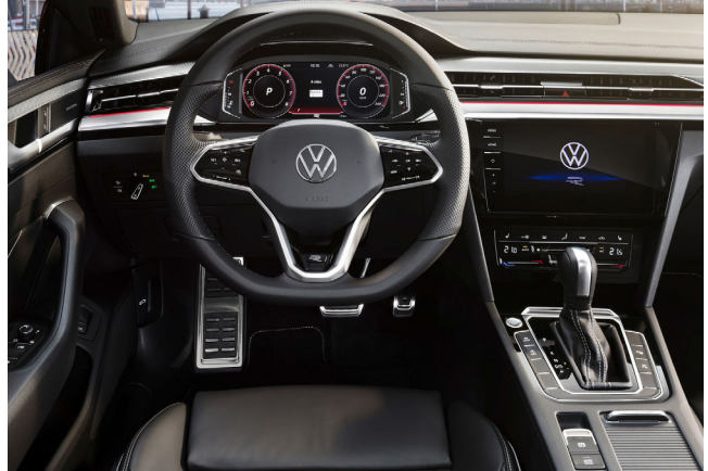
The above images show optional "Nappa" leather pack R-Line, with optional ErgoComfort seats