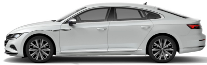
Oryx White Pearl Effect**