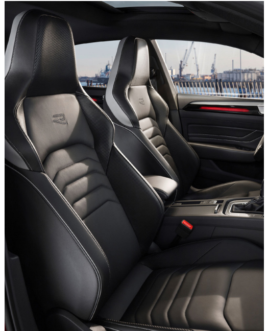
The above images show optional "Nappa" leather pack R-Line, with optional ErgoComfort seats