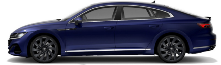
Lapis Blue Metallic**