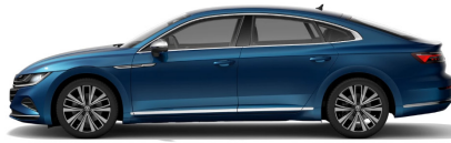
Kingfisher Blue Metallic**