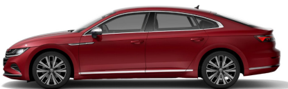
Kings Red Metallic*1