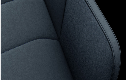
"ArtVelours Microfleece/Vienna" cloth & leather Titan Black (TO) Standard on Elegance models