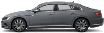
Moonstone Grey Solid