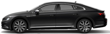
Manganese Grey Metallic*