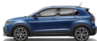
Reef Blue Metallic *