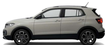
Ascot Grey Solid *