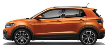
Energetic Orange Metallic *