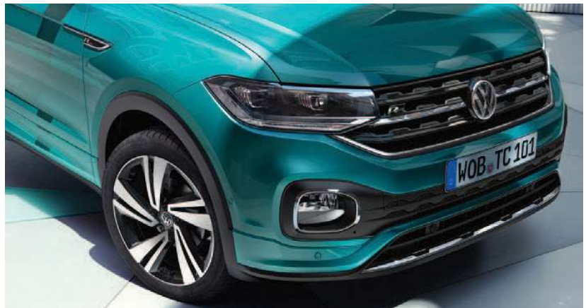
Images show optional interior equipment and 18" Nevada alloy wheel.