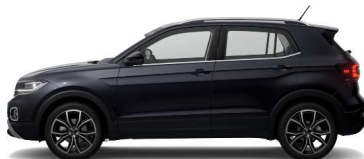
Smokey Grey Metallic *