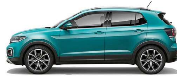
Makena Turquoise Premium Metallic *