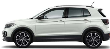
Pure White Solid *