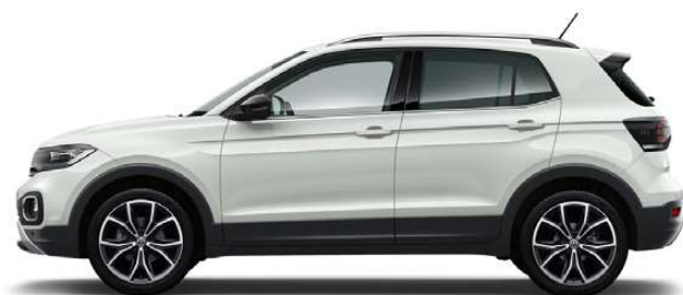
Design Pack: Black