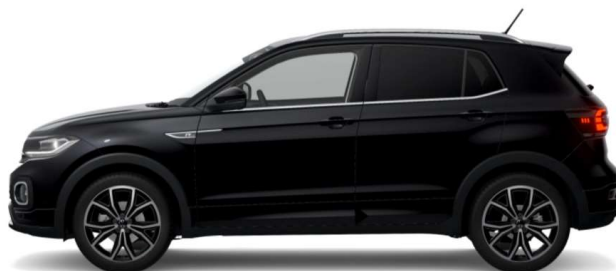
Design Pack: Black