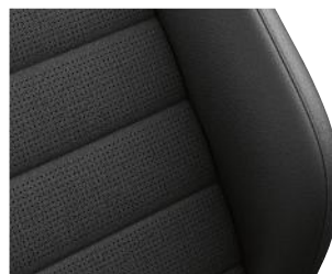
"Vienna" leather* Titan Black (TW) Standard on e-Golf Executive Edition