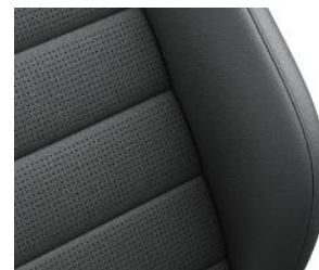
"Vienna" leather* Pure Grey (UW) Standard on e-Golf Executive Edition