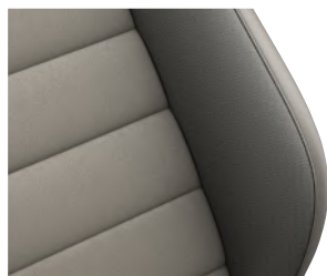
"Vienna" leather* Shetland/Shetland XW Standard on e-Golf Executive Edition