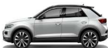
White Silver Metallic Black Roof