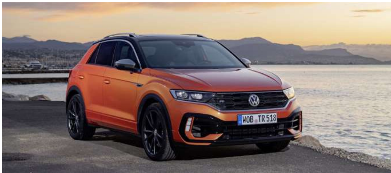
Note: Pretoria 19" Alloy Wheels displayed in image above, with optional Energetic Orange metallic paint

The above specifications are for information purposes only as our products are continually updated and changes may be made to the specifications at any time. If you require any specific feature, you must consult your local dealer who is regularly updated with any change in specification. Specifications are subject to change without notice.