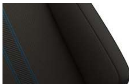
"Tracks 4" Cloth Ravenna Blue (GK) Optional on Design