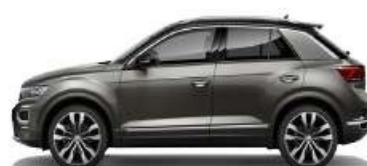
Indium Grey Metallic Black Roof White Roof