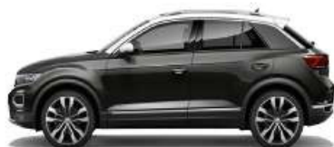
Urano Grey Solid White Roof