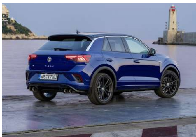
Note: Pretoria 19" Alloy Wheels displayed in image above, with optional Lapiz Blue metallic paint