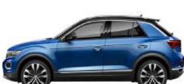
Ravenna Blue Metallic Black Roof White Roof