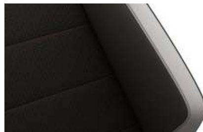
"Gem" Cloth Titan Black/Ceramique (FJ) Standard on Sport & R-Line *red stitching now removed