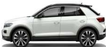
Pure White Solid Black Roof