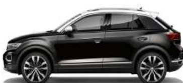
Deep Black Pearl Effect White Roof