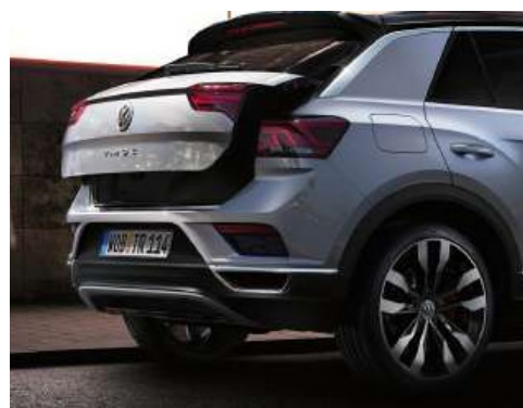
Image shows optional Electric Opening/Closing luggage compartment. Optional on T-Roc Sport and R-Line

The above specifications are for information purposes only as our products are continually updated and changes may be made to the specifications at any time. If you require any specific feature, you must consult your local dealer who is regularly updated with any change in specification. Specifications are subject to change without notice.