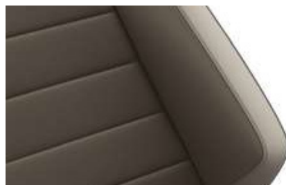
"Vienna" Leather Quarzit/Ceramique (HR) Optional on Design & Sport & R-Line