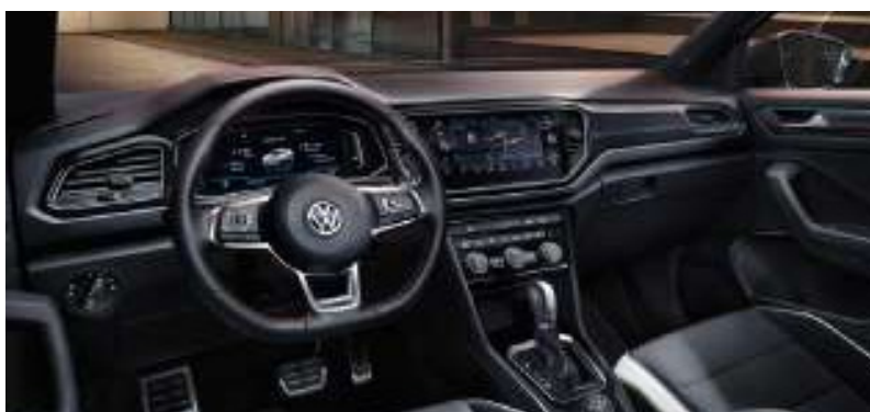
Image shows T-Roc Sport with the optional Sport Pack WAT.