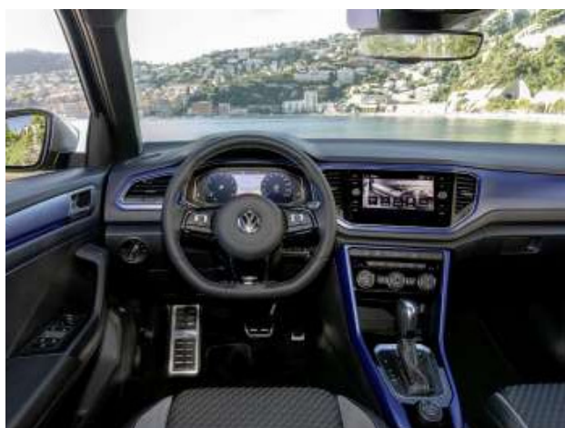
Note: Optional Decorative Insert Blue STV displayed in image below