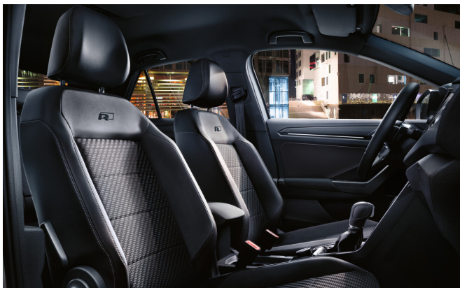
Image shows optional 'R-Line' interior