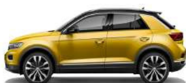
Turmeric Yellow Metallic Black Roof White Roof