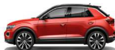
Flash Red Solid Black Roof White Roof