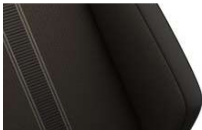
"Tracks 4" Cloth Black Oak/Ceramique (FF) Standard on Design