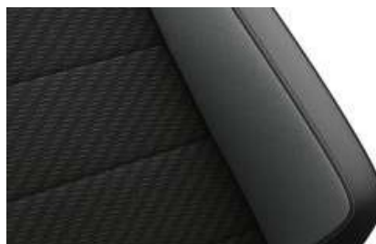
"Carbon Flag" R-Line cloth Crystal Grey/Titan Black (OK) Optional on R-Line Standard on R Model