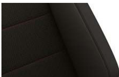
"Gem" Cloth Titan Black/Antracite (XD) Optional on Sport & R-Line Note: Must order optional Sports pack WAT. *red stitching now removed