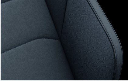
"ArtVelours Microfleece/Vienna" cloth & leather Titan Black (TO) Standard on Elegance models