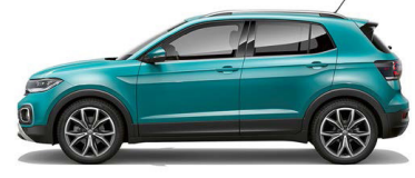
Makena Turquoise Premium Metallic *