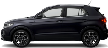
Smokey Grey Metallic *