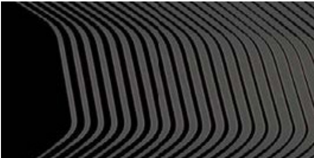
Transition - High-gloss Black & Grey

Optional on Style & R-Line (Design Pack Black & Design Pack Bamboo Garden)