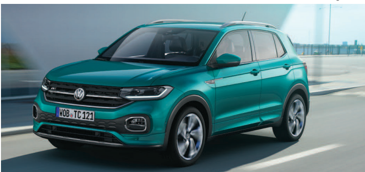
Images show optional interior equipment and 18" Nevada alloy wheel.