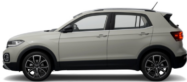
Ascot Grey Solid *