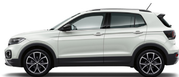
Design Pack: Black