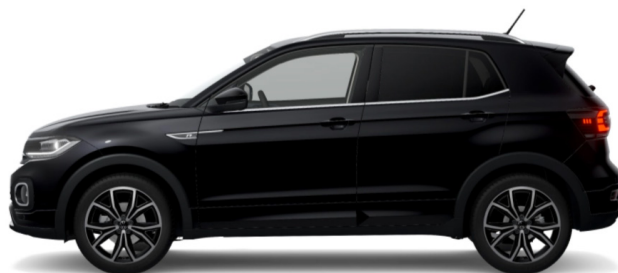
Design Pack: Black