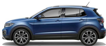
Reef Blue Metallic *