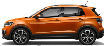
Energetic Orange Metallic *