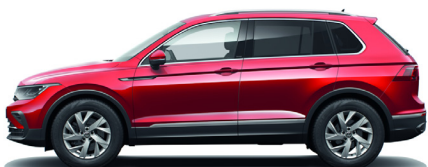
Kings Red Metallic* 2