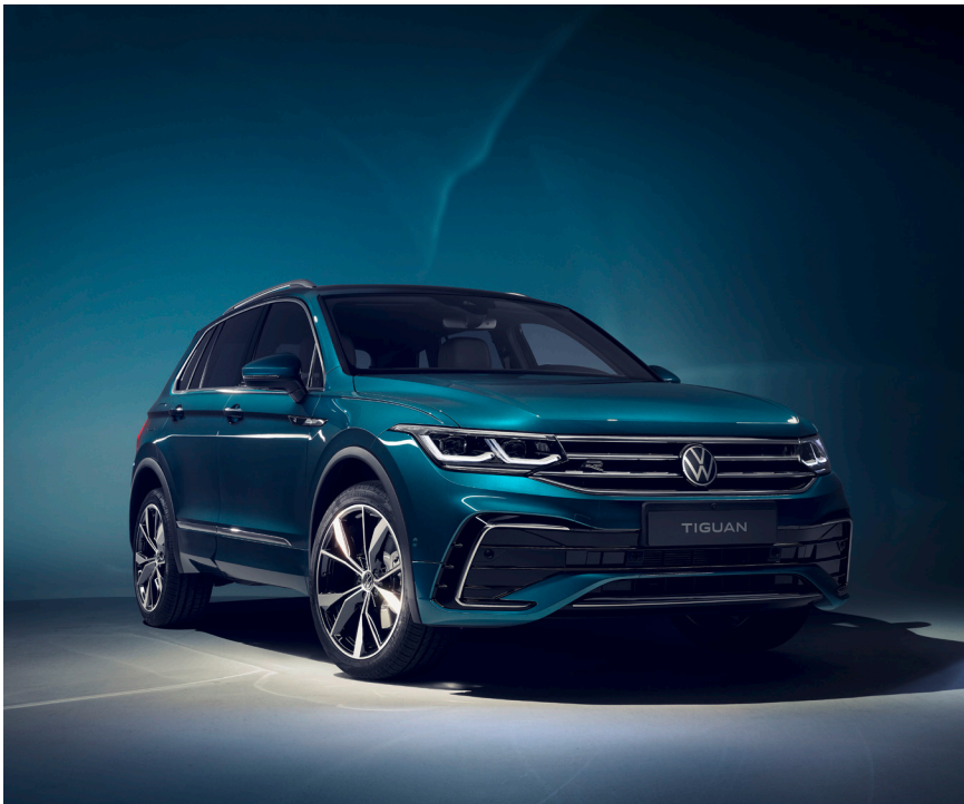
Note: The above image shows optional Nightshade Blue metallic paint with optional 20" 'Misano' alloy wheels