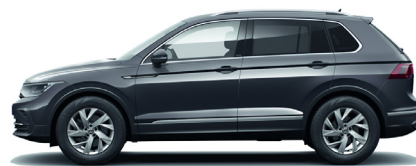
Dolphin Grey Metallic*

Note: Not available in combination with Black Style Exterior Pack