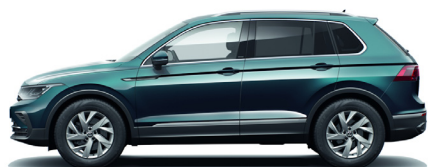
Nightshade Blue Metallic*