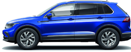
Lapiz Blue Metallic*

Note: Not available in combination with Black Style Exterior Pack