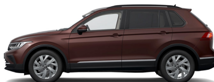
Ginger Brown Metallic* 2