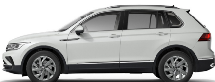
Oryx White Pearl Effect*†

Note: Only available on R-Line and R models Note: Not available on PHEV models