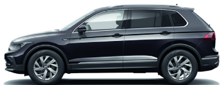
Urano Grey Solid 2