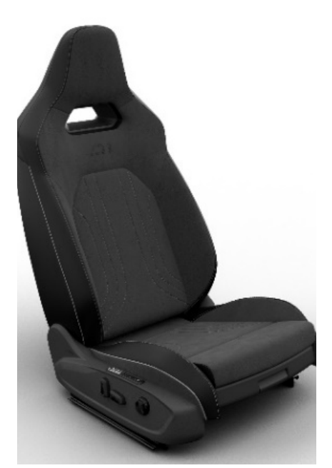
ArtVelours Top Sport Seats Soul Standard on ID.4 Max & GTX Max and optional on Style and GTX

Artvelours Microfleece/Leatherette Soul/Platinum Grey Standard from ID.4 Life Electric controls are standard from ID.4 Tech, and optional on ID.4 Business, Style and Family