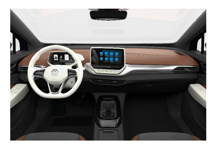
Standard from ID.4 Life Not available on ID.4 Max Soul/Electric White/Florence Brown