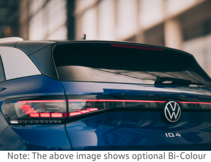
Note: The above image shows optional Bi-Colour Styling Package