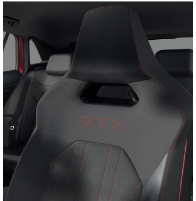
GTX Art Velours/Leatherette Soul/Flash Red Standard on ID.4 GTX PLUS Optional on ID.4 GTX

Note: Some parts of leather interior trim will contain artificial leather. Note: The print processes do not allow exact reproduction of the upholstery & insert colours.