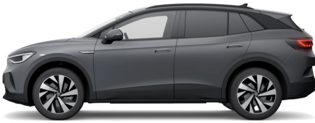
Moonstone Grey Solid C2C2