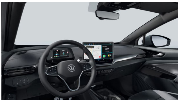
Standard from ID.4 PURE / PRO