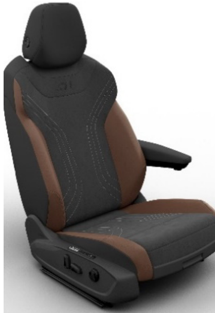
Artvelours Microfleece/Leatherette Soul/Florence Brown Standard from ID.4 PURE / PRO

Electric controls are available via the addition of the Interior Plus Package