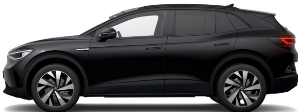
Grenadilla Black Metallic 1 0E0E