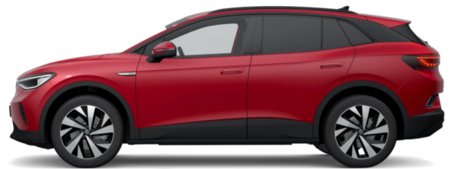
King's Red Metallic 1 P8P8