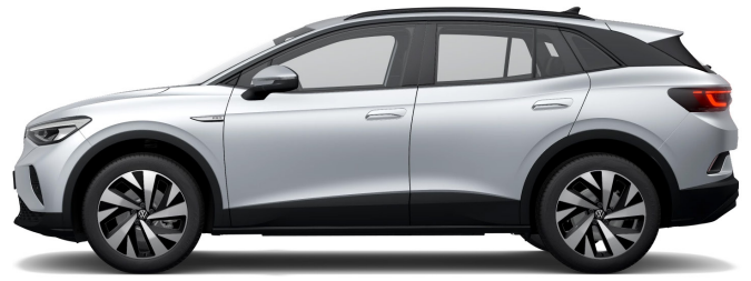
Scale Silver Metallic 1 1T1T