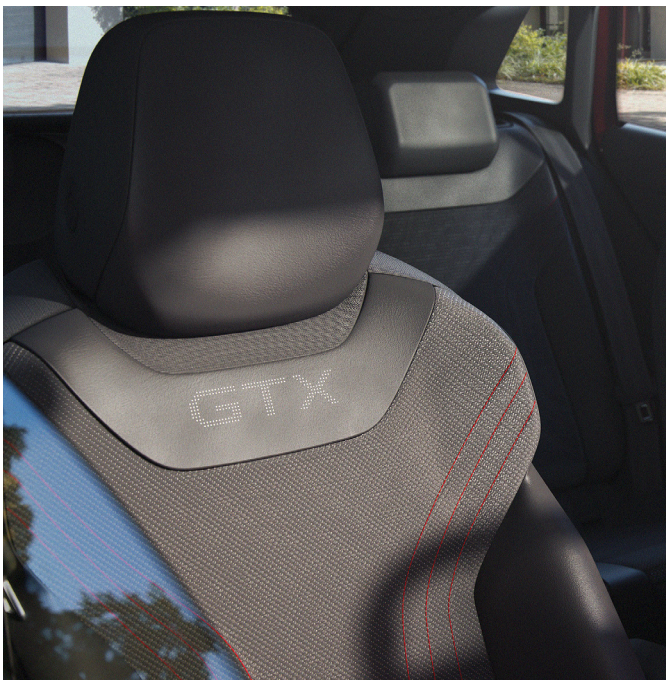
GTX Cloth/Leatherette Soul/Flash Red Standard on ID.4 GTX