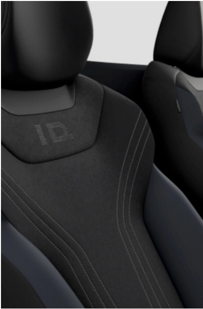
Artvelours Microfleece/Leatherette Soul/Platinum Grey Standard from ID.4 PURE / PRO

Electric controls are available via the addition of the Interior Plus Package