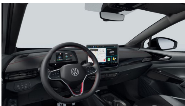
Standard on ID.4 GTX