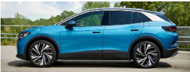
Costa Azul Metallic 1,2 3K3K

1 Optional at extra cost · 2 Not available on GTX models Note: All paints (with the exception of Grenadilla Black Metallic) can add a black exterior roof with the optional extra Bi-Colour Styling Package Please note, the print processes do not allow exact reproduction of the paint colours.