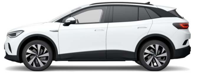
Glacier White Metallic 1 2Y2Y