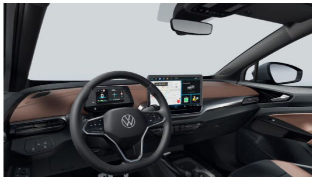
Standard selection from ID.4 PURE / PRO