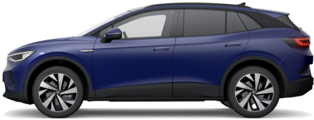
Blue Dusk Metallic 1 2P2P