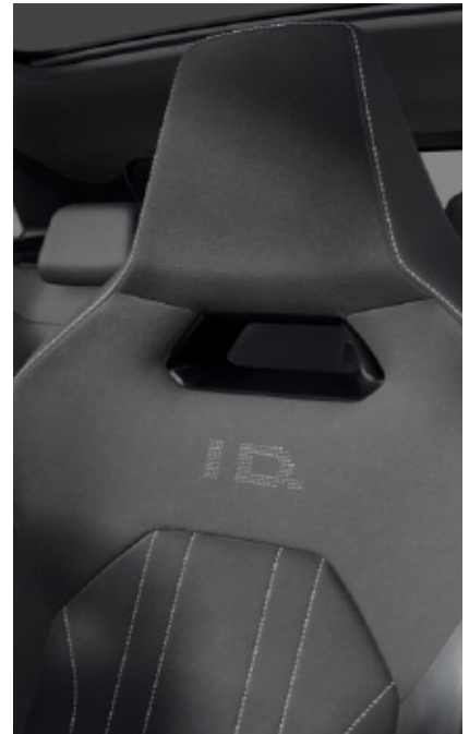
Artvelours Microfleece/Leatherette Soul/Platinum Grey Standard from ID.4 PRO STYLE Optional on ID.4 PURE / PRO

Electric controls are available via the addition of the Interior Plus Package