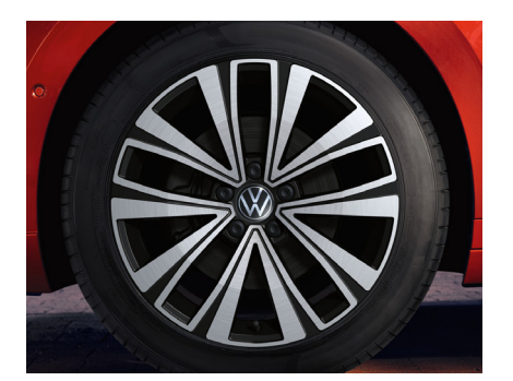
STANDARD ON ELEGANCE MODELS 18" 'Muscat' alloy wheels in 8J x 18 Tyres: 245/40 R18

The addition of optional extras may result in the vehicle increasing in Co2 g/km and therefore, attracting a higher rate of VRT than described in this product guide. For your exact configuration value, both Co2 g/km and RRP, please visit volkswagen.ie configurator.