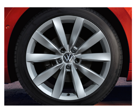
OPTIONAL ON ELEGANCE MODELS 19" 'Chennai' alloy wheels in Adamantium Silver 8J x 19 Tyres: 245/40 R19