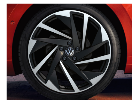
OPTIONAL ON ELEGANCE & R-LINE MODELS 20" 'Nashville' alloy wheels 8J x 20 Tyres: 245/35 R20