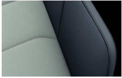
"ArtVelours Microfleece/Vienna" cloth & leather Mistral/Raven (YS) Optional on Elegance models