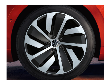
STANDARD ON R-LINE MODELS 19" 'Montevideo' alloy wheels 8J x 19 Tyres: 245/40 R19