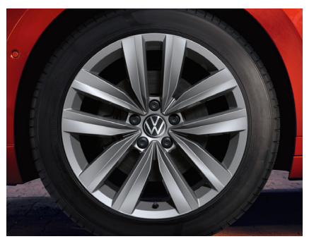
OPTIONAL ON ARTEON ELEGANCE MODELS 18" 'Almere' Adamantium Silver alloy wheels 8J x 18 Tyres: 245/45 R18