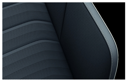
"Nappa" leather * (WL6) Titan Black (TO) Optional on Elegance models