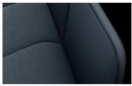
"ArtVelours Microfleece/Vienna" cloth & leather Titan Black (TO) Standard on Elegance models