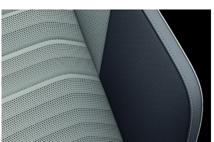
"Nappa" leather * (WL6) Mistral/Raven (YS) Optional on Elegance models

* Optional at extra cost. • Please note, the print processes do not allow exact reproduction of the upholstery colours.