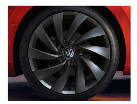
OPTIONAL ON R-LINE MODELS 20" 'Rosario' black alloy wheels 8J x 20 Tyres: 245/35 R20

The addition of optional extras may result in the vehicle increasing in Co2 g/km and therefore, attracting a higher rate of VRT than described in this product guide. For your exact configuration value, both Co2 g/km and RRP, please visit volkswagen.ie configurator.