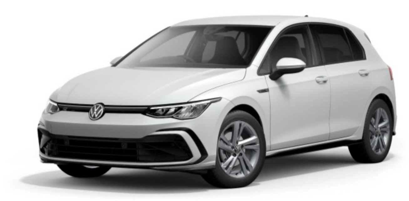
The above specifications are for information purposes only as our products are continually updated and changes may be made to the specifications at any time. If you require any specific feature, you must consult your local dealer who is regularly updated with any change in specification. Specifications are subject to change without notice.