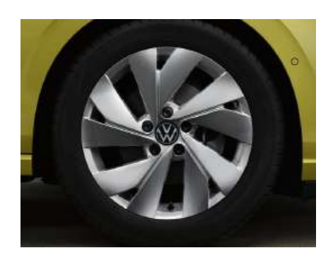
STANDARD ON STYLE 17" Belmont alloy wheels 7.5J x 17 Tyres: 225/45 R17