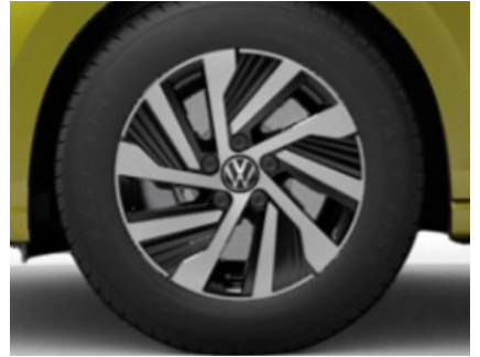
STANDARD ON STYLE eHybrid 16" eHybrid alloy wheels 7J x 16 Tyres: 205/55 R16