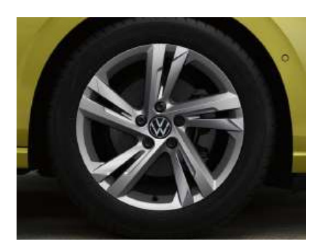
STANDARD ON R-LINE 17" Valencia alloy wheels 7J x 17 Tyres: 225/45 R17