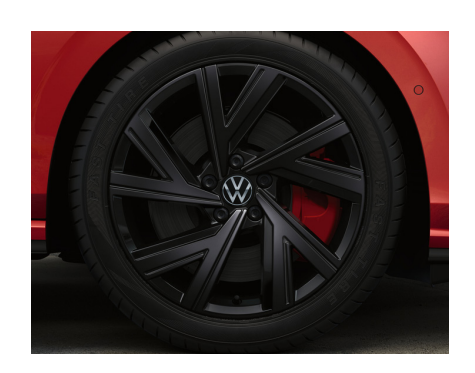
OPTIONAL ON R-LINE 18" Bergamo alloy wheels finished in black 7.5J x 18 Tyres: 225/40 R18

Note: The above image shows 18" Bergamo alloy wheel in black on Golf GTI model