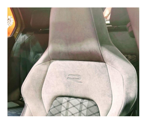
'R-Line' cloth Anthracite (IR) Standard on R-Line