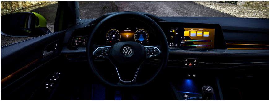
*Mobile Key functionality is only available on selected smartphones. To view compatible phones please visit https://www.volkswagen.ie/en/connectivity/we-connect/all-services.html

Note: Traffic Jam Assist only on Automatic models