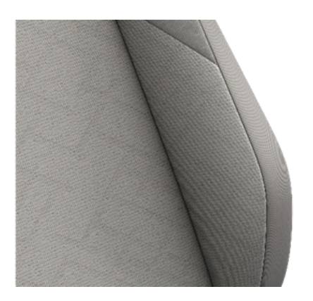
'Maze' cloth Storm Grey (CE) Standard on Life models