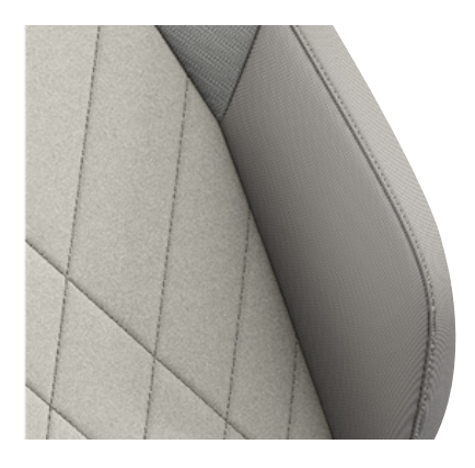
'ArtVelours' cloth Storm Grey (CE) Standard on Style models