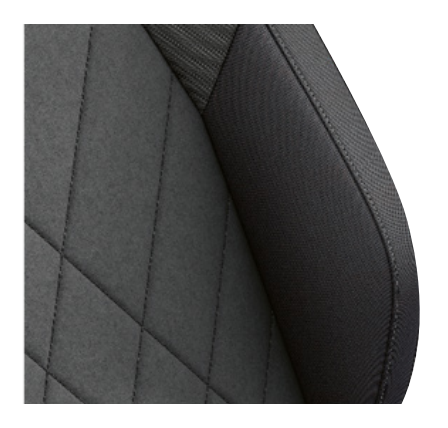
'ArtVelours' cloth Soul (BD) Standard on Style models