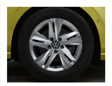
STANDARD ON LIFE 16" Norfolk alloy wheels 7J x 16 Tyres: 205/55 R16

The addition of optional extras may result in the vehicle increasing in Co2 g/km and therefore, attracting a higher rate of VRT than described in this product guide. For your exact configuration value, both Co2 g/km and RRP, please visit volkswagen.ie configurator.