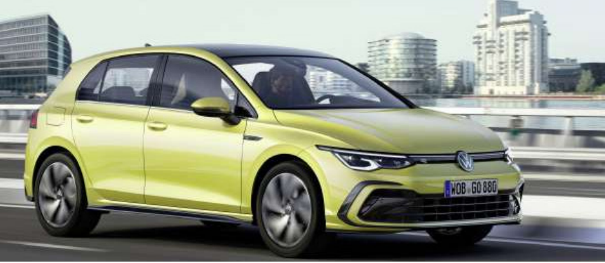
Note: The above image displays optional Panoramic Sunroof, Matrix lights and 18" Bergamo alloy wheels

» Curtain airbag system for front and rear passengers including front side airbags and centre airbag (from CW48 Production)