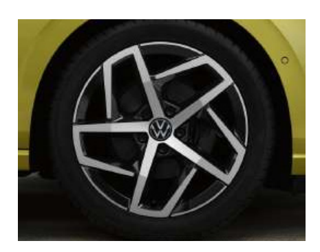
OPTIONAL ON STYLE 18" Dallas alloy wheels 7.5J x 18 Tyres: 225/40 R18