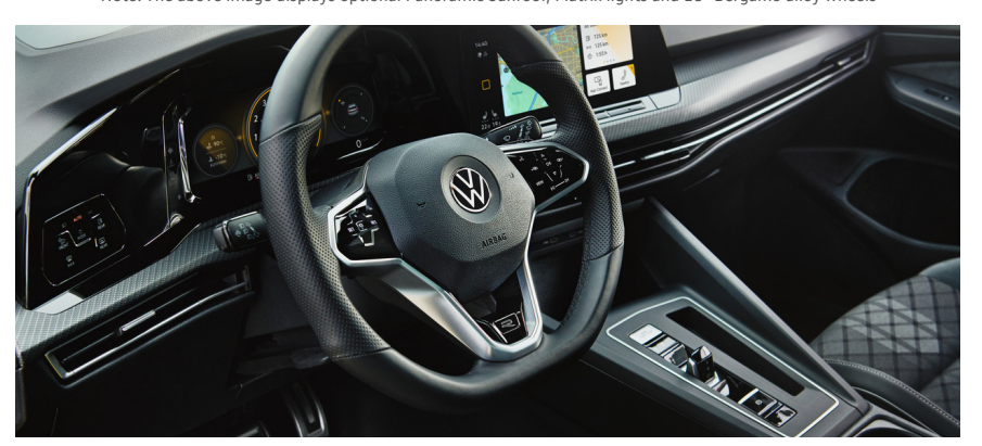
Note: The above image displays DSG \operatorname{\mathsf{Gear}}\nolimits\operatorname{\mathsf{Selector}}\nolimits