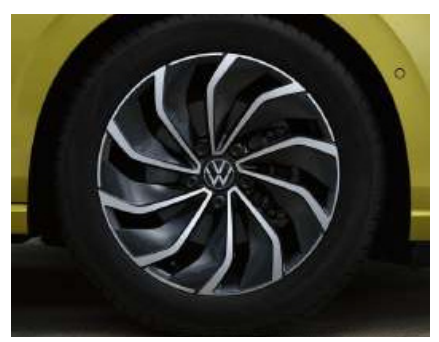
OPTIONAL ON LIFE & STYLE 17" Ventura alloy wheels 7.5J x 17 Tyres: 225/45 R17