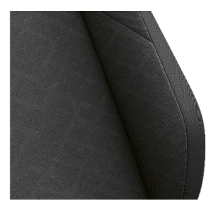
'Maze' cloth Soul (BD) Standard on Life models