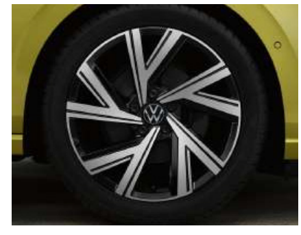
OPTIONAL ON STYLE & R-LINE 18" Bergamo alloy wheels 7.5J x 18 Tyres: 225/40 R18