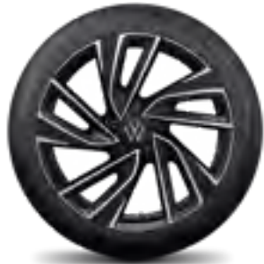
"Adelaide", 19-inch Black, diamond-turned