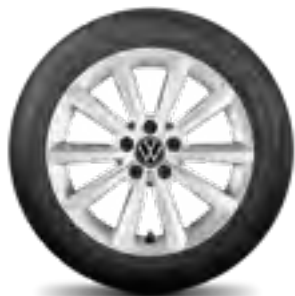
"Merano", 17-inch Brilliant Silver