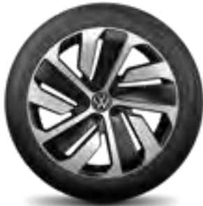
"Montevideo", 19-inch Black, diamond-turned