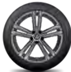
"Sebring", 18-inch Grey Metallic

Further accessories for your wheels, including valve caps, wheel bolt locking sets, tyre bag sets and snow chains, can be found in the universal accessories section on page 49.