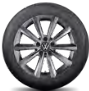
"Merano", 17-inch Adamantium Dark Metallic