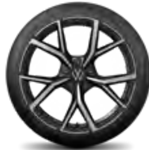
"Estoril", 20-inch Black, diamond-turned