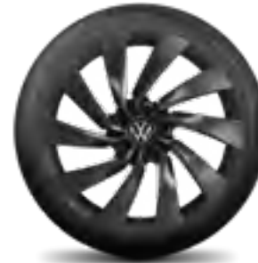
"Rosario", 20-inch Dark Graphite Matt