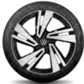
"Nevada", 18-inch Black, diamond-turned

Further accessories for your wheels, including valve caps, wheel bolt locking sets, tyre bag sets and snow chains, can be found in the universal accessories section on page 51.