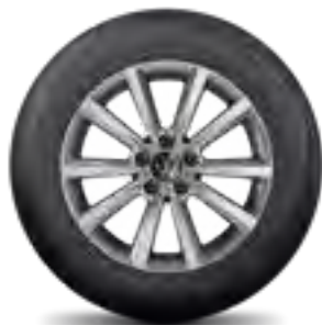
"Merano", 16-inch Adamantium Dark Metallic