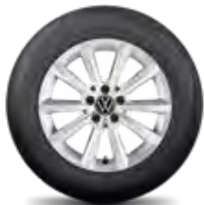
"Merano", 16-inch Brilliant Silver