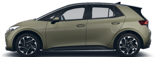
Dark Olivine Green Metallic* H0A1