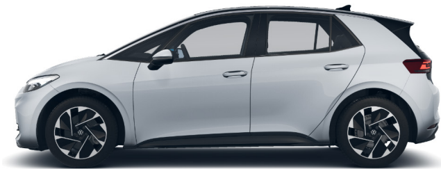
Scale Silver Metallic* 1TA1