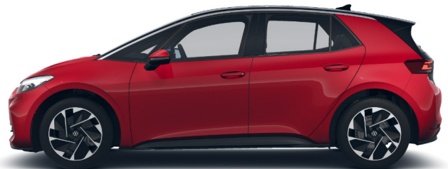
King's Red Metallic* P8A1