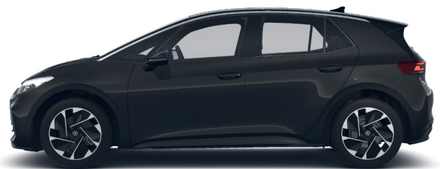
Mythos Black Metallic* 0EA1