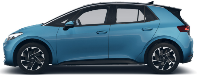
Costa Azul Metallic* 3KA1