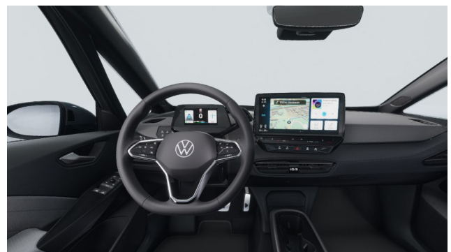
Standard on ID.3 Pro S Dusty Grey Dark stitching Crystalgrey

Note: Some parts of leather interior trim will contain artificial leather Note: The print processes do not allow exact reproduction of the upholstery & insert colours. Effective from 18 December 2023, for production until CW02/2024 onwards. All prices include VAT and VRT. Prices and specifications are subject to change without notice.