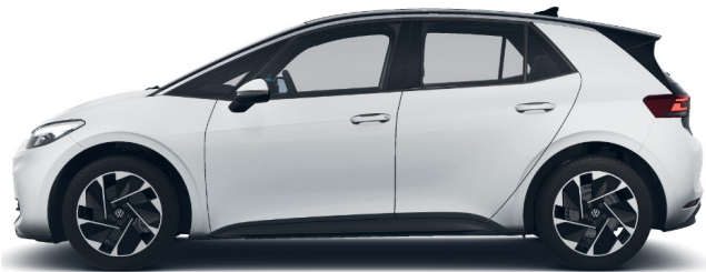
Glacier White Metallic* 2YA1