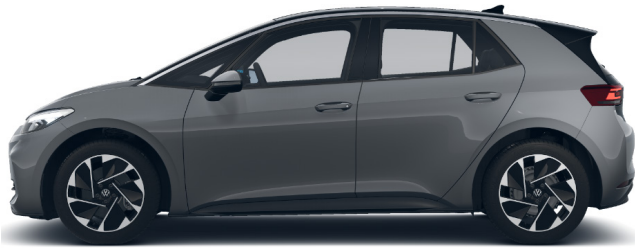
Moonstone Grey Solid C2A1