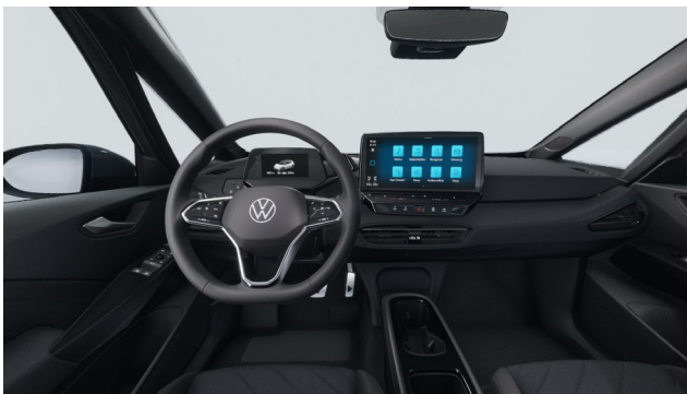
Standard on ID.3 Pro Soul stitching Crystalgrey