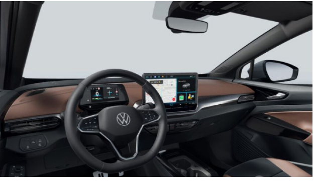
Standard selection from ID.5 PRO PLUS