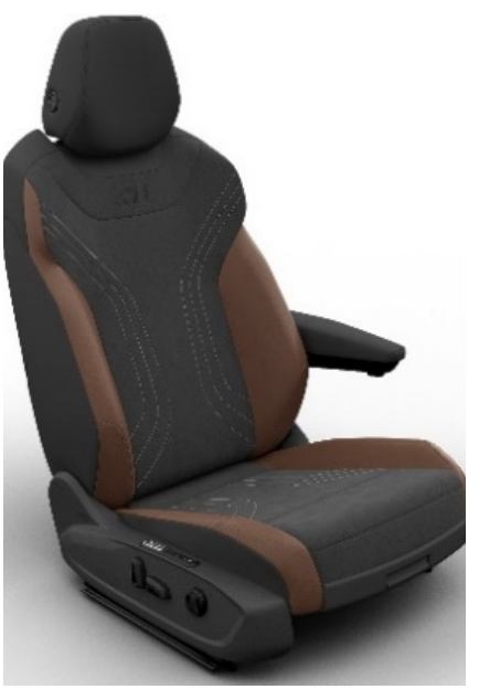
Artvelours Microfleece/Leatherette Soul/Florence Brown Standard from ID.5 PRO PLUS Optional on ID.5 PRO Electric controls are available via the addition of the Interior Plus Package