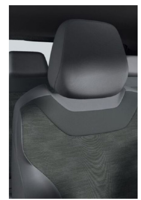
Fabric 'Matrix' Soul/Platinum Grey Standard from ID.5 PRO