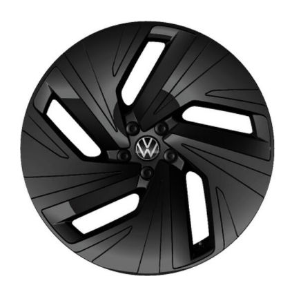
Optional on ID.5 GTX

20" 'Drammen' alloy wheels 8J x 20 in front, 9J x 20 in rear Tyres: 235/50 R20 in front 255/45 R20 in rear