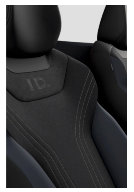
Artvelours Microfleece/Leatherette Soul/Platinum Grey Standard from ID.5 PRO PLUS Optional on ID.5 PRO Electric controls are available via the addition of the Interior Plus Package