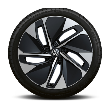
STANDARD ON ID.5 PRO / PRO PLUS

19" 'Hamar' alloy wheels 8J x 19 in front, 9J x 19 in rear Tyres: 235/50 R19 in front 255/45 R19 in rear