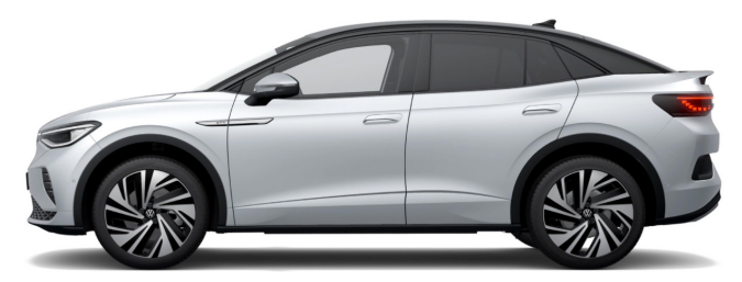
Scale Silver Metallic1,3