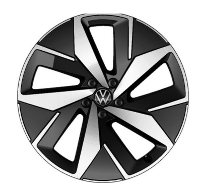
STANDARD ON ID.4 GTX

21" 'Narvik' in Black alloy wheels 8.5J x 21 in front, 9J x 21 in rear Tyres: 235/45 R21 in front 255/40 R21 in rear