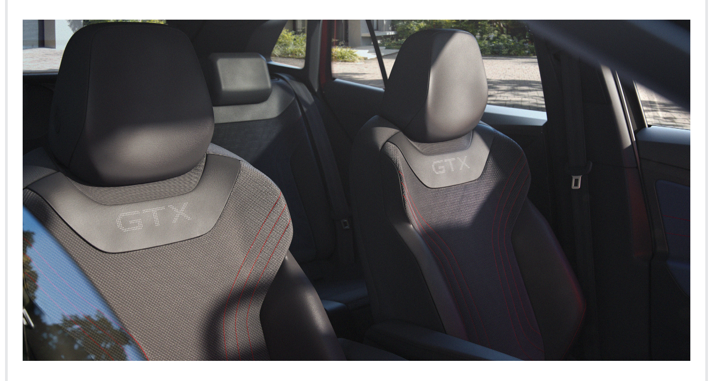
GTX Cloth/Leatherette Soul/Flash Red Standard on ID.5 GTX

Note: Some parts of leather interior trim will contain artificial leather. Note: The print processes do not allow exact reproduction of the upholstery & insert colours.