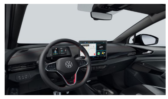
Standard on ID.5 GTX