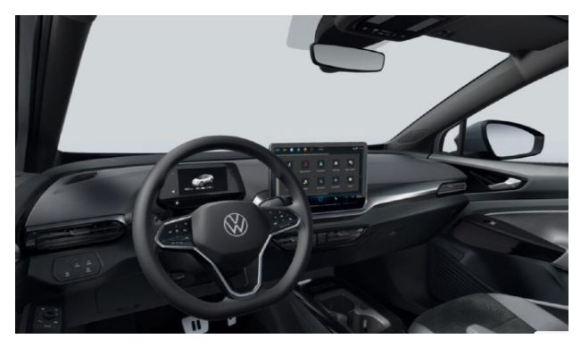
Standard from ID.5 PRO