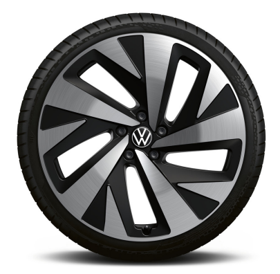
Optional on ID.5 PRO / PRO PLUS

19" 'Hamar' alloy wheels 8J x 19 in front, 9J x 19 in rear Tyres: 235/50 R19 in front 255/45 R19 in rear