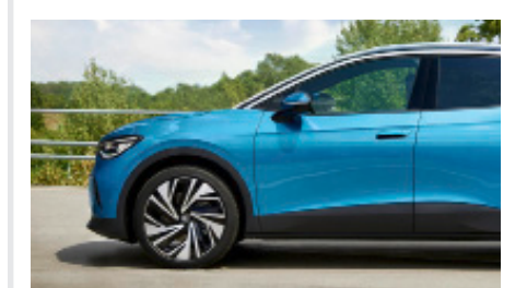
Costa Azul Metallic1,2