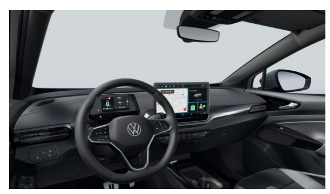
Standard from ID.5 PRO PLUS