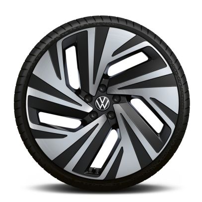
Optional on ID.5 PRO / PRO PLUS & ID.5 GTX

20" 'Ystad' alloy wheels 8J x 20 in front, 9J x 20 in rear Tyres: 235/50 R20 in front 255/45 R20 in rear